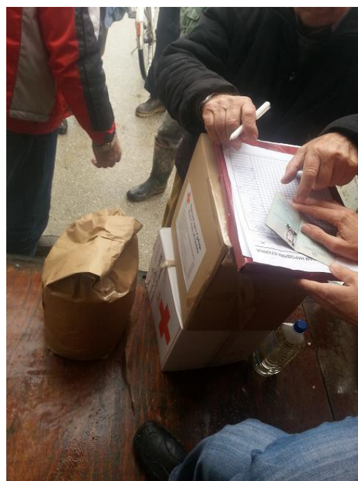
Distribution in Cacak.

The municipalities affected by the floods were organizing emergency evacuations with the assistance of the Sector for Emergency Management and the Red Cross of Serbia where needed. The Government of Serbia has alerted all emergency services to assist the residents affected by flash floods. All Red Cross activities have been coordinated with the Department for Emergency Situations of the Republic of Serbia. Operational Headquarters of the Government of Serbia introduced