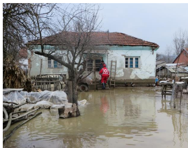
Relief distribution in the flooded city of Kraljevo.

The floods and some landslides affected the local infrastructure, houses, crops and agriculture fields as well as blocked roads, interruption of the regular water supplies, loss of the food stocks for households and domestic animals. More than 30 villages in the western parts of Serbia witnessed electricity power cuts due to the damages on infrastructure including substation malfunctions. Around 600-700 households were temporarily evacuated for 24 to 72 hours.