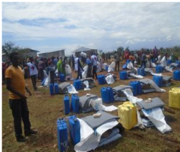
NFI distribution in West Harerghe zone

For the procurement of NFI items, a bid document was prepared and advertised in the newspaper. Fourteen suppliers applied to supply the items and a bid analysis committee revised all the documents and the quality of the items were examined by the technical committee by referring the specification of ERCS disaster preparedness and response department. The quality of the items was cross checked with the accepted sample upon delivery.