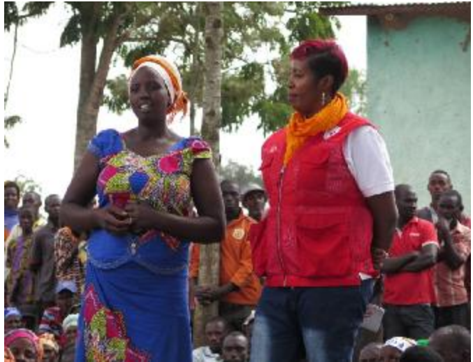
Figure 4 Beneficiary in Gatsibo district at community meeting in June 2017 with RRCS and IFRC, sharing her concerns

The most affected population by the disaster (storm and heavy winds) is 135 families (approx. 675 persons) who fall under the following criteria: displaced households (those whose homes were destroyed), the chronically ill and elderly, female-headed households, lactating mothers and children under-five, pregnant women and single parents. In addition, the needs assessment shows that there is a total of 811 households who are in need for roofing of their latrines.