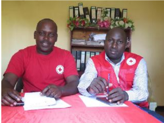
Figure 3 Rwanda Red Cross Gatsibo branch managers (IFRC)

The IFRC is providing assistance through the East Africa and Indian Ocean Islands cluster office and through the Africa regional office based in Nairobi, Kenya. Since the onset of the disaster, there has been regular contact with the IFRC EAIIO regional representation's disaster management department; and regular updates on the situation and activities planned have been shared. A joint IFRC and RRCS monitoring visit has been performed in June 2017.