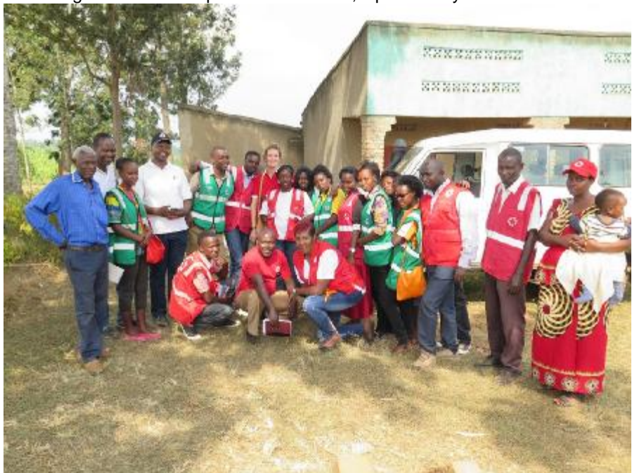
Figure 6 Joint IFRC and RRCS monitoring mission (IFRC)

The IFRC EA-IOI operations team is providing technical support and has so far performed monitoring visits.