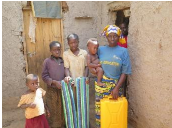
Figure 2 Beneficiaries in Gatsibo district with RRCS NFI's

The Rwanda Red Cross Society (RRCS) has been mobilizing their staff members and volunteers to provide immediate assistance from its contingency stocks to the population affected by heavy storms in Gatsibo district, Kiramuruzi Sector. A rapid emergency needs assessment was carried and a follow up assessment has been carried out in the last week of June 2017, in the Gatsibo district, Kiramuruzi Sector. The distribution of Non-Food items (NFIs, including shelter and hygiene related items affected population) has been completed. Latrine construction, health sensitization (PHAST) and mobile cinema are on-going. The DREF extension is requested to replenish those items distributed from the National Society stock, which is on-going.