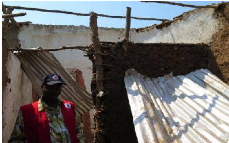
Figure: 1 Make-shift bedroom of a household without roof

The above figures are based on a field needs assessment performed by the Rwanda Red Cross Branch office at end of June.