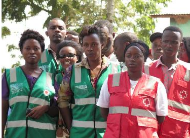
Figure 5 Volunteers from the Gatsibo district supporting the DREF operation

For this section kindly refer to the EPoA document