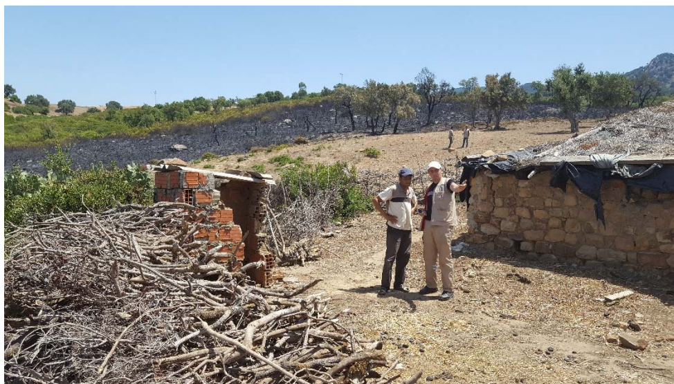
TRC visiting and assisting affected families

Initial assessment was conducted by staff and volunteers from TRC in two governorates (Jendouba and Bizerte). The assessments show that 250 households (1,000 people, around 400 in Jendouba and 600 in Bizerte) have been affected, including vulnerable groups such as people with disabilities, single parent families, families with many children and older people living alone. The immediate needs among the affected communities are: food, shelter, essential household items, water distribution and provision of psychosocial support to the affected families. Health and hygiene materials are also required for affected communities. Trained TRC volunteers are supporting the national authorities and emergency services in providing First Aid to those injured.