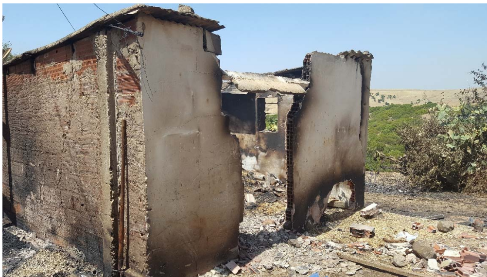
Fire destroys house in Khmairia – Ain Draham

Most of the 500 affected families are being sheltered within the local community, staying with relatives, neighbours, colleagues and other acquaintances. Some 70 families in Bizerte were temporarily sheltered in a public school and have since been moved to a transitional shelter run by the authorities.