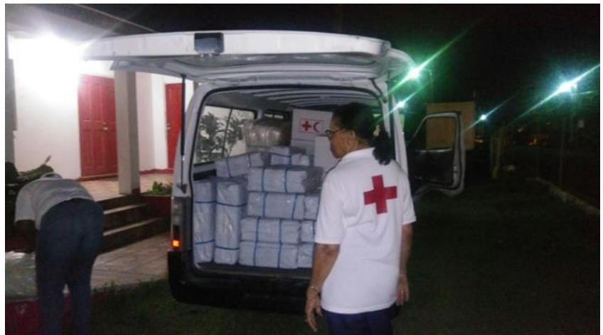
Photo 2: Director General of the St. Kitts and Nevis Red Cross, along with its volunteers loading some of the pre-positioned items.

The Antigua and Barbuda Red Cross and St Kitts and Nevis Red Cross Societies are leading the response action with support from the International Federation of Red Cross and Red Crescent Societies (IFRC) and Movement partners. The National Societies have participated on a daily basis in the National Emergency Operations Centre (EOC). In these coordination meetings, information has been shared with humanitarian partners in both countries. The ABRC and the SKNRCS are working in close relationship with national authorities in charge of disaster response in the countries. Joint assessments of the situation have been ongoing.