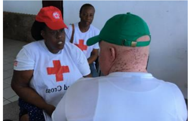
Photo 4: Volunteers with the Antigua and Barbuda Red Cross Society register people evacuated from Barbuda who are now staying with families and friends.

As part of an agreement between the Antigua and Barbuda Red Cross (ABRC) and the National Office of Disaster Services (NODS), the registration of persons from Barbuda who were displaced by Hurricane Irma is ongoing with about 70 per cent of the population registered so far. A total of 245 households (1,031 persons) are currently registered and the process continued on 20 September.