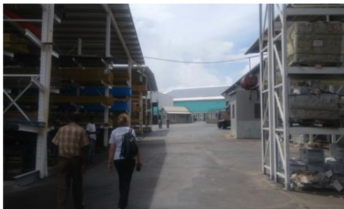
Photo 5: Shelter Specialist doing a walkthrough of a storage facility in St. Kitts.

In St Kitts and Nevis: Market assessments is being done, focused on CTP for shelters