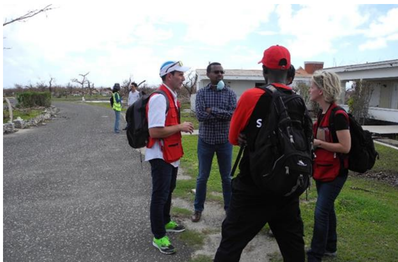
Photo 3: Officials from the Ministry of Health, the Barbuda Branch of the ABRC and a delegation of the IFRC during the site visit of the medical facility in Barbuda.

Antigua and Barbuda: The Ministry of Health presented a formal request to the ABRC, in coordination with the IFRC, to set up a medical field station on Barbuda to provide basic medical services to the personnel and Barbudan population that will be part of the clean-up and rehabilitation activities in the coming weeks. The exact location on the island and the type of medical/clinical materials were confirmed and agreed with the Ministry of Health and the process was initiated for the shipment in during the course of this coming week. This was supported by a health delegate from the Canadian Red Cross.