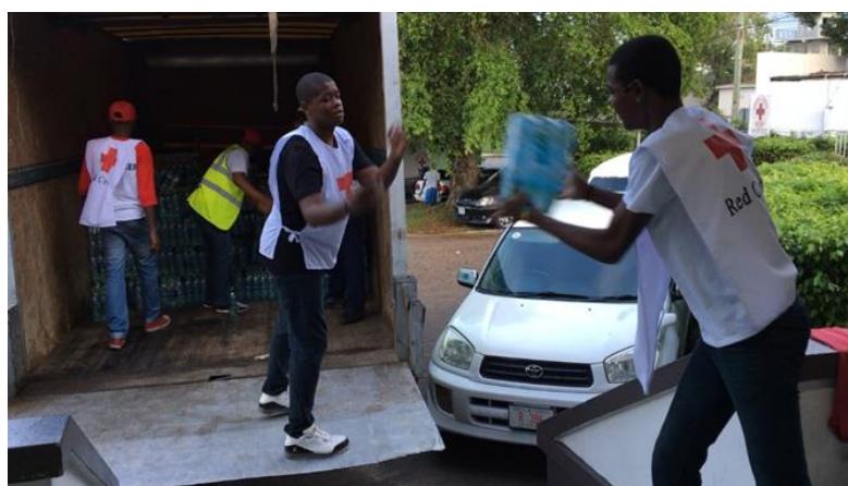
Photo 1: Volunteers with the Antigua and Barbuda Red Cross Society offload packs of bottled water to be distributed to people affected by Hurricane Irma (Photo: Giovanni Zambello / IFRC).

21 September 2017: Operation Update no. 1 issued.