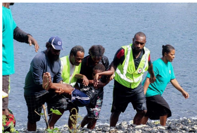
VRCS conducted a Simulation exercise as preparedness measure as volcanic activity increased.

On 18 of December bulletin eleven (11) was issued by the Vanuatu Meteorology & Geohazard stated that satellite imagery analysis confirms a remarkable land deformation on Ambrym island, therefore people from Ambrym and neighboring islands may continue to expect earthquakes. North, East and West of Ambrym reported heavy ash fall and cracks from the localized earthquake. Southeast of the island was reported to be heavily affected.