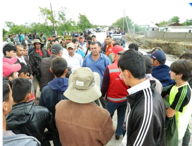
Image 2: RCST supported evacuation activities in Farkhor district

As a member of National Emergency Response Commission, the National Society deployed team members, who participated in the preliminary assessment in affected areas during 2 to 7 June 2019.