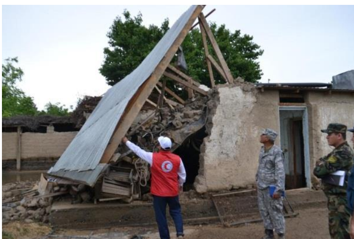
Image 1: Rapid needs assessment with the National Emergency Response Commission.

Continuous heavy rains resulted in mudflows and floods countrywide between 1 and 7 June 2019. In total, 10 mid-scale mudflows and floods have occurred throughout Tajikistan. 1350 households (6,750 people) were heavily affected in Khatlon province (Vose, Farkhor, Temurmalik, Pyanj and Khuroson districts), Sughd province (Devashtich, Isfara, Penjikent and Knibodom districts) and in Direct Ruled Districts (DRD) Rudaky and Fayzobod. At least 4 persons were killed in Khuroson, Penjikent and Pyanj. The mudflows repeatedly hit the same locations (in Farkhor and Vose) on 6 June 2019. Around 650 households were evacuated to neighbouring villages into safe places i.e. schools, mosques and relatives' houses, and have already returned to their houses, but another 150 households from Farkhor district remain evacuated in safe locations. The Government commenced relief operations in all the affected districts and calls for assistance from in-country humanitarian partners.