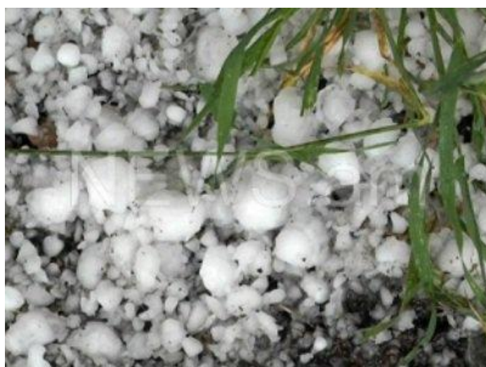
Image 1: Hailstones that damaged crops on 27 June 2019.

According to information provided by regional authorities, in Karnut community, the hail damaged 100 per cent of 214.4 hectares of wheat, barley, oat, potatoes and other crops. Basen community has 619.5 hectares of damaged crops. According to local information, the crops have been left without leaves after the hail and thus the annual harvest is completely destroyed. Hovit has 255 hectares of cultivated land destroyed by the hail. Saratak community had approx. 400 hectares of wheat destroyed by the hail. Damages to other communities count from 30 to 60 per cent for almost all types of crops. Moreover, a few houses and cattle farms had roofs and windows damaged, but not in a large scale.