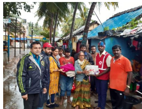
Red Cross volunteer distributing Relief Items in the flood affected areas.

Karnataka is dealing with a trail of destruction caused by monsoon rains which affected 13 districts namely Belagavi, Vijayapura, Bagalkot, Yadagiri, Raichur, Uttara Kannada, Udupi, Dakshina Kannada, Kodagu, Chikkamagaluru, Hassan, Haveri and Shivamogga. The death toll has reached 94 and the numbers of houses damaged have reached more than 30,000 which becomes a major concern. More than 3000 livestock have been affected. Thousands are shifted to the relief camps. As the floodwaters are receding, more information of damage to properties, especially houses are coming to light. Rebuilding and restoring the damaged houses and medical services are priority activities in the affected areas. NDRF 19 teams, 12 column of Army, 2 SDRF, Indian Coast Guard/ Navy divers and Indian Air Force Helicopters are deployed for relief, rescue and evacuation. Karnataka State Branch of Red Cross had made a public appeal to donate in-kind and cash for relief assistance to the flood affected families. In addition, they distributed food, dress materials, family kits and organized health camps. The trained Social Emergency Response Volunteers (SERVs) have worked tirelessly providing first aid, family service links and maintained contact between the family members during the crisis.