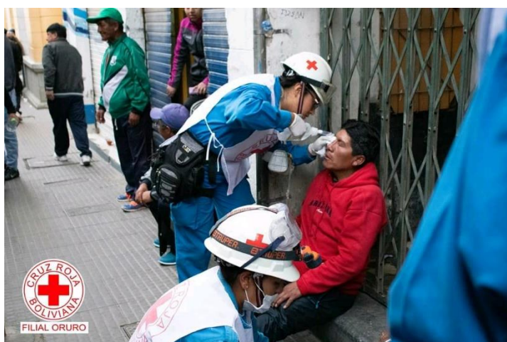
Bolivian Red Cross (BRC) volunteers providing first aid services in Oruro – Bolivia.

On 10 November 2019, the President of the Plurinational State of Bolivia (herein Bolivia) resigned from office, after a series of events, demonstrations and protests triggered by the election process held on 20 October. This situation has triggered a series of blockades, stoppages throughout the country. For the moments the cities with the greatest impact are El Alto, La Paz and Cochabamba, where the blockades have had an impact on the general population due to the shortage of food and fuel, causing increased scarcity and prices, reduced public services that includes transport and causes difficulties for the transportation of the wounded.