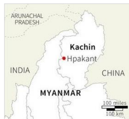
Hpakant, Kachin – affected area of the jade mine collapse.

Financial support through the Disaster Relief Emergency Fund (DREF) will provide MRCS the resources to support search and rescue (SAR) efforts, First Aid (FA), psychosocial support (PSS) to the affected people and their families, provision of PSS for RCVs involved in SAR and socioeconomic support to affected families.