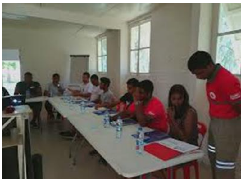
Volunteer training in Rodrigues

Active bands passed over the island on the night of Wednesday 17 January 2018 as active cloud bands continued to affect the island.