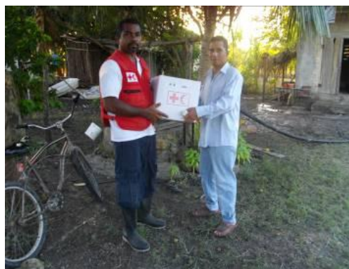
From August to November 2012, Belize Red Cross Society volunteers delivered NFIs to the vulnerable population around the country.

The European Commission Humanitarian Aid and Civil Protection replenished 80 per cent of the DREF allocation made for this operation. The major donors and partners of the DREF include the Australian, American and Belgian governments, the Austrian Red Cross, the Canadian Red Cross and government, the Danish Red Cross and government, the European Commission Humanitarian Aid and Civil Protection (ECHO), the Irish and the Italian governments, the Japanese Red Cross Society, the Luxembourg government, the Monaco Red Cross and government, the Netherlands Red Cross and government, the Norwegian Red Cross and government, the Spanish government, the Swedish Red Cross and government, the United Kingdom Department for International Development (DFID), the Medtronic and Z Zurich foundations, and other corporate and private donors. The IFRC, on behalf of the National Society, would like to extend thanks to all the donors for their generous contributions. Details of all donors can be found at: http://www.ifrc.org/en/what-we-do/disaster-management/responding/disaster-response-system/financial-instruments/disaster-relief-emergency-fund-dref/