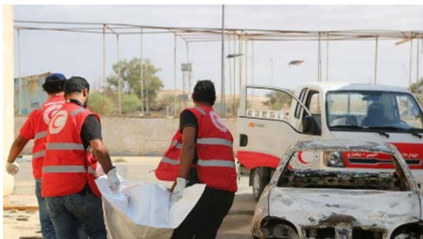
Libyan RC volunteers on duty during the violent acts that have shaken the country.

The security situation in Libya has been highly volatile since May and, combined with the political instability related to the transition in the country, is now deteriorating. The increase of the security incidents has caused hundreds to be killed and wounded across a number of communities across the country, particularly around Benghazi and Tripoli, clashes move recently to the mountain areas in the west. Since October, weeks it became even more difficult to get accurate data of the casualties of the conflicts in Tripoli and Benghazi, in addition to data of displaced people due to frequent and quick changes in the dynamics of the conflict. People living in the areas directly affected by the fighting in Benghazi and Tripoli are trying to move to safer areas, while others remain trapped. Libyan Red Crescent Society (LRCS) staff and volunteers are risking their lives to help evacuate those trapped, who had been locked until fighting calmed down. In October, over 15,000 Libyan families have been reported to be displaced from their homes in the conflict areas not to count the displaced families who did not register or seek support; displaced families have dispersed in different direction inside Libya. Thousands of families have fled the conflicts into neighbouring countries including Tunisia.