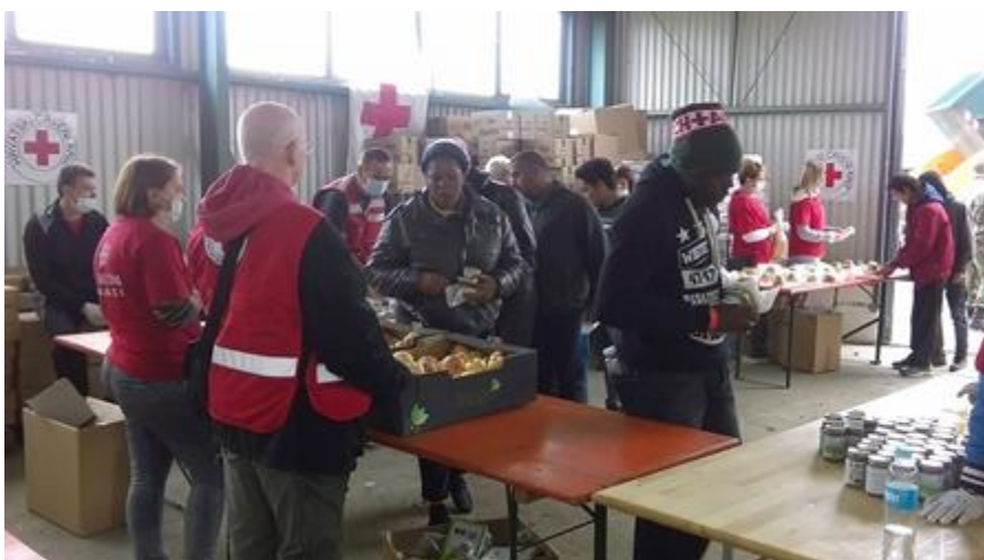
Red Cross food distribution point in Opatovac

In the first few days of the migrant crisis in Croatia, an average of 450 CRC staff members and volunteers of the CRC and its local branches had been active in the field covering all the locations where Croatian RC was present – a total of 17 different locations. During the first weekend of the inception of the crisis when more than 12,000 persons entered the country in one day, there were 777 staff and volunteers deployed on the ground at 17 different locations of