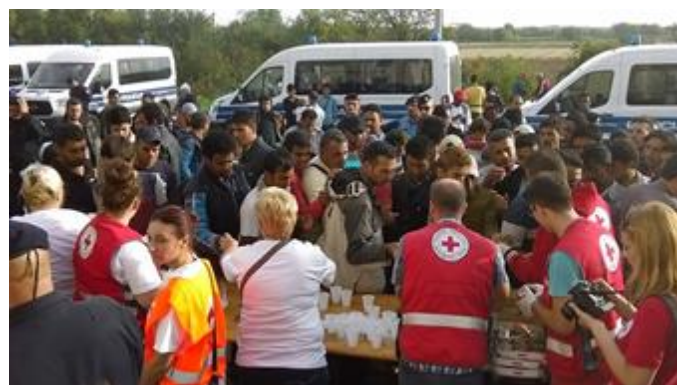
Red Cross food distribution point in Tovarnik.

Since 16 th September thousands of migrants have been arriving at the Croatian border crossings from Serbia. During the first two days people were transferred to five temporary reception centres organised by the Croatian Ministry of Interior in Tovarnik, Zagreb-Porin, Ježevo, Zagreb-Velesajam, and Sisak by buses and trains organized by the Croatian authorities. As the influx of migrants continued to grow on the second day, the Ministry of Interior opened temporary reception centres in Čepin and in Beli Manastir subsequently. The Croatian Red Cross was present at all the locations of the reception centres as well as at the entrance and exit border crossings providing food, water and hygiene items to the migrants. At the reception centres the Ministry of Interior organised the registration of the migrants upon their arrival.