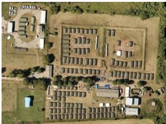
Temporary Reception Centre, Opatovac.

By Sunday, 20 September, all reception centres established during the first few days have been completely vacated as all migrants at the centres have left for Hungary and Slovenia. All people entering at the border crossing Tovarnik as well as border line in Bapska have been transferred since to the Temporary Reception Centre Opatovac – a tent settlement opened by the Ministry of Interior on 20 September in the vicinity of the Croatian border line with Serbia where the majority of migrants are entering Croatian territory. The temporary reception centre in Opatovac has a capacity of a maximum of 4,000 people. The migrants are expected to stay in Opatovac no more than 36 to 48 hours from where they are being transported in an organised manner by buses and trains toward the state border. Other reception centres used so far are prepared and in case of need can also be used for temporary accommodation. The Croatian Red Cross was present at