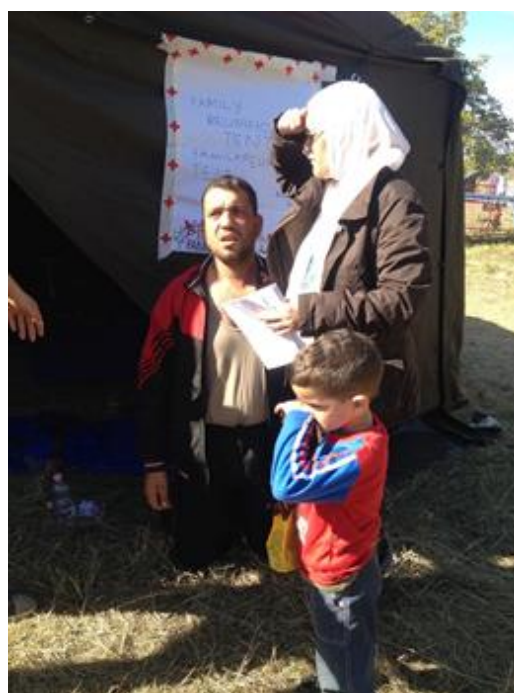
Reunited family, Red Cross RFL in Opatovac.

Food items and information activities are targeting the whole group of 20,000 DREF beneficiaries sheltered at the temporary reception centres. RFL services will be provided to migrants in distress who were separated from their family members along their long route to Croatia.