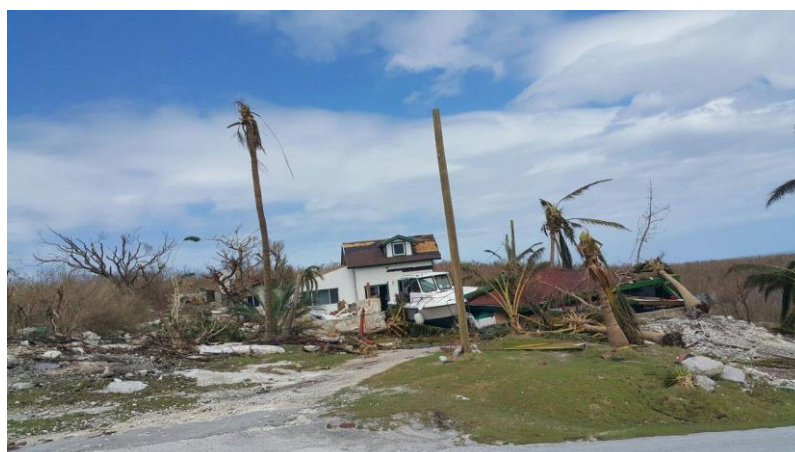
Damage to property, Long Island.

On 2 October 2015, the island chain of the Bahamas experienced significant damage with many houses destroyed and widespread reports of heavy flooding and storm surges mainly in the central and southern sections of the archipelago due to the passage of Hurricane Joaquin. On 3 October, Hurricane Joaquin moved slowly across the southern and central islands unleashing torrential rains, wind and storm surges, leading to flooding and salt water intrusion in several areas.