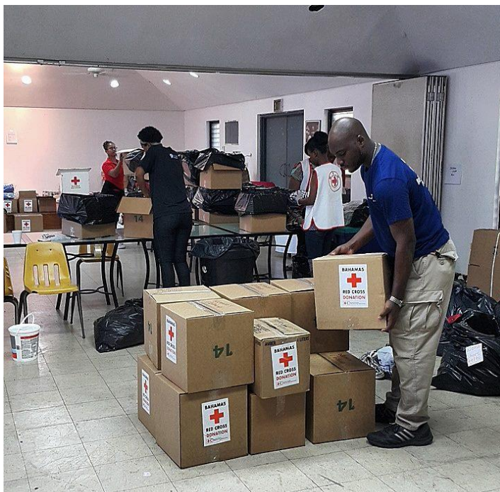
Bahamas Red Cross volunteers coordinating donated items for immediate distribution.

A six-member team from CDEMA, CARPHA and PAHO, which was supported NEMA and UNOCHA, deployed to Acklins and other affected islands from October 6 to conduct damage and needs assessments.