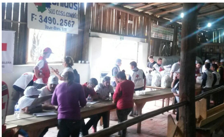
Beneficiaries receive food and cleaning kits.

On 14 July 2015, the Civil Defence of Rio Grande Do Sul declared an emergency at the municipal level, reporting flooding in several cities. The Uruguay River's water level reached 13.57 meters; the river's average water level is only five or six meters. This situation was a result of heavy rains in the region and the overflow of the Rio Gravataí and Arrolo Sapucaya Du. According information provided by Brazil's Civil Defence, the rivers flooded 264 towns, affecting 283,140 people in the states of Parana, Santa Catarina and Rio Grande du Sul, A total of 8,063 people were forced to seek shelter in evacuation centres. After the emergency in July, rains continued in the affected areas, affecting new places and once again flooding areas that were affected in July in some cases. As of October 2015, 7,488 families have fled their homes, of which 1,283 are staying in public housing and 6,205 families are staying with friends or relatives in the state of Rio Grande do Sul.