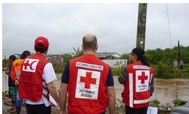
Sector evaluations carried out by the field teams from Brazilian Red Cross.

Sector evaluations were carried out by a subsidiary of Porto Alegre's Department of Relief through its director, the operations coordinator and the RIT deployed for the operation. The assessments aimed to identify if the needs had changed since the start of the emergency, as well as to make staff aware of the activities of other actors in order to avoid duplicating aid.