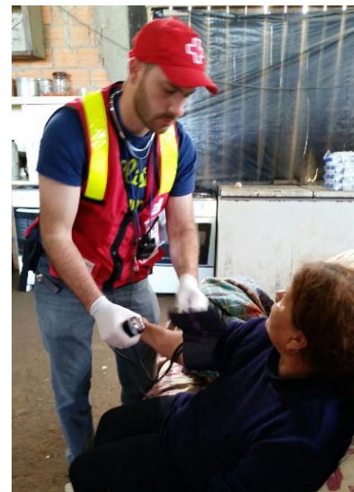
Volunteer providing first aid care.

Talks were given to the community on the prevention of leptospirosis, meningitis C, respiratory illnesses and first aid. To date, 337 families have been reached through hygiene promotion activities.