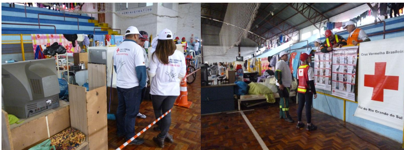
Health teams conducting evaluations in evacuation centres and preparing the hygiene and health promotion station.