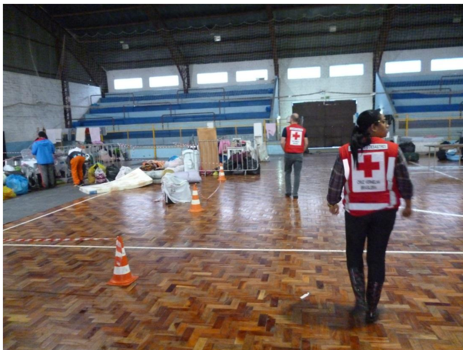
The evacuation centre in Cachoeirinha do Sul.

New sector assessments in all of the communities were conducted to optimize the distribution of humanitarian aid.