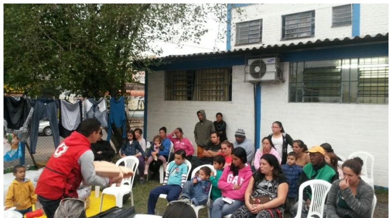
First aid promotion activities for families in an evacuation centre in the municipality of Gravataí.

The health promotion activities conducted by the health centres were very limited. There is a health centre and a hospital 20 kilometres away. Therefore, these activities are being promoted through the Porto Alegre branch health teams in order to provide assistance to the evacuation centres.