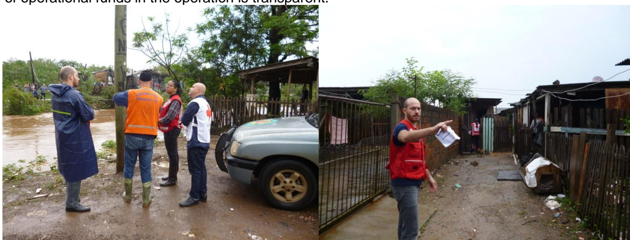
Coordination visit along with the Gravatai, community from the Vila Rica Civil Defence.

The National Society developed new procurement procedures manual that will serve as a tool to ensure the use of operational funds in the operation is transparent.