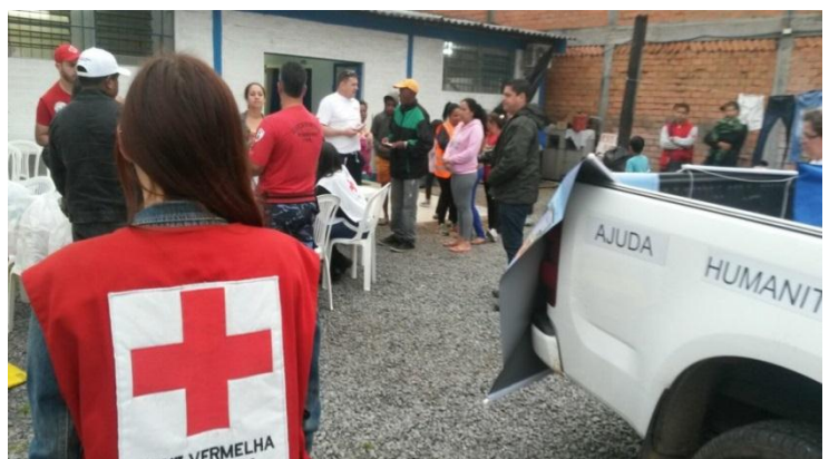
Distribution of humanitarian aid to families sheltered in Gravataí.

The main activities of the affected communities of Cachoerinha and Garavatá are agriculture and fishing; collecting and recycling waste and paper is another main livelihood activity in the two aforementioned communities, while other people in the community work in shops and in the municipality's industrial zone. However, there is no place to work at the moment since homes and land in the community are flooded and waste and paper were swept away by the overflowing river waters and contaminated. Therefore, their livelihoods have been completely disrupted; the affected population is now looking for ways to get