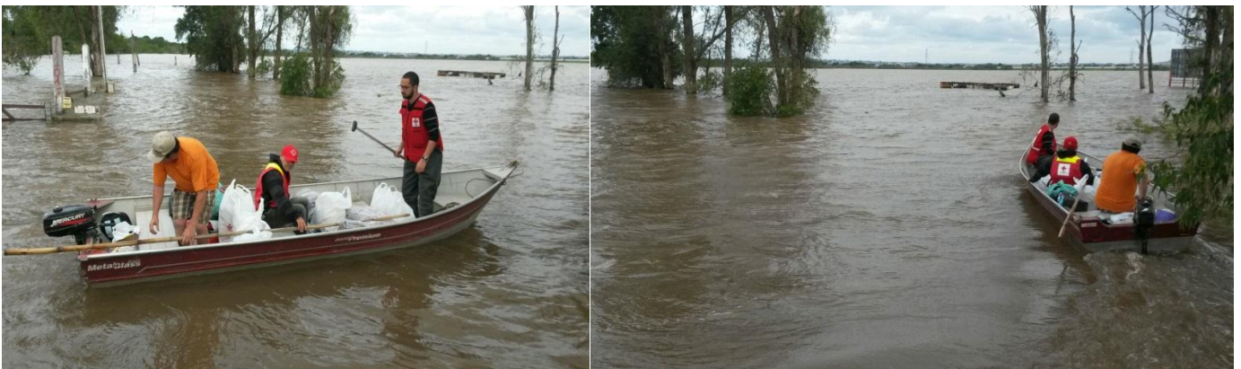
Distribution of humanitarian aid to 11 families in the community of El Puente in Cachoeirinha do Sul.

Adopted measures: The specifications were adapted based on technical requirements and the availability of materials in the local market.