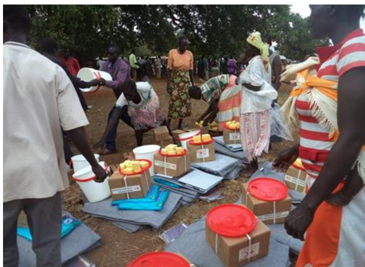
Distribution of non-food items by SSRC. At least 207,694 people in four states of South Sudan were supported with emergency assistance through this operation.