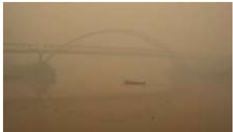
The dire condition of the haze in Palangkaraya