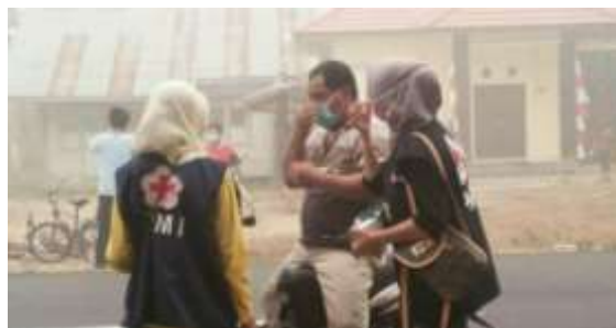
Distribution of face masks by PMI volunteers

PMI chapter in Jambi is currently conducting fundraising activities and seeking potential cooperation with local mini market for mask provision such as Alfamart, Indomart, Hypermart. PMI Riau has distributed 200 Sansevieria plants to communities, a plant that purifies air by absorbing toxins through the leaves and producing pure oxygen. PMI has dispatched two mobile water purification units, ten water tankers and two ambulances (eight more will be sent in the next days) to the affected area.