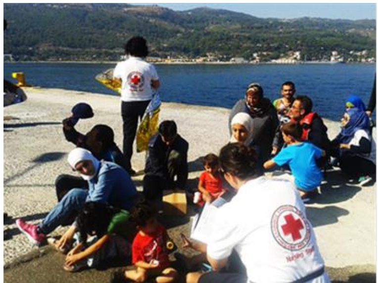
Nurses in Samos providing First Aid and Psychological First Aid to refugees, who have just been rescued.

20 November 2015: based on the evolving nature of the situation and the need for coordinated support, this Emergency Appeal is launched for 2.2m Swiss francs for up to 1 million beneficiaries.