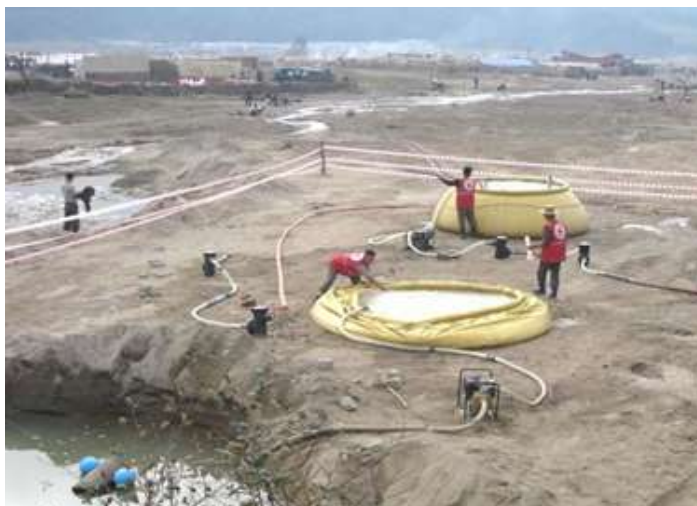
Distribution of safe and clean drinking water Sonbong district, Rason City, September 2015.

DPRK RCS/IFRC in collaboration with local authority had deployed two water treatment units in Paekhak-dong, Sonbong district under Rason City on 8 September 2015 for one month. An emergency WatSan response team, consisting of one technical officer and technicians from headquarters and 15 local Red Cross volunteers, operated the water treatment units for a period of 18 to 20 hours each day to produce in average 90,000 to 110,000 litres of water. This is sufficient to meet the daily basic needs of 10, 000 people (9–10 litres/person/day). Approximately 30,000 people living in emergency shelters or host families also received safe and clean water for drinking and domestic use.