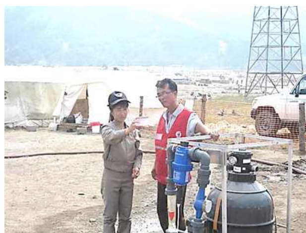
Water treatment units deployed in Paekhak-dong, Sonbong district, Rason City on September 2015.

In two different major floods, the country received more than half of its annual average rainfall (321mm) causing wide spread damage and loss to lives, properties and belongings. According to UNOCHA snapshot based on information provided by the State Committee on Emergency and Disaster Management (SCEDM) and the DPRK Red Cross Society (RCS), approximately 18,896 people were affected, 11,632 people were displaced, 89 people confirmed dead, 5,370 houses were either destroyed or damaged, 5,400 people had lost access to safe drinking water and 125 hectares of farmland and at least 375 MT of crops were lost.