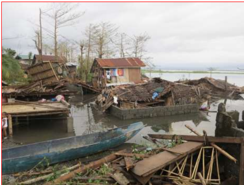
In the town of Najuan, province of Oriental Mindoro, hundreds of shelters made of light materials have been severely damaged or destroyed by both the strong winds and subsequent floods.

In addition to supporting the immediate response of local authorities, PRC deployed five assessment teams – comprising technical persons and generalists from national headquarters and some chapters – to areas hit hardest by Typhoon Melor to assess the extent of the damage and the immediate needs on the ground. One team each covered the provinces of Oriental Mindoro, Sorsogon and Romblon while two teams covered Northern Samar. The IFRC Country Office deployed a communications officer and a planning, monitoring, evaluation and reporting (PMER) officer alongside the teams that covered Sorsogon and Oriental Mindoro respectively. Assessments have since been concluded and informed the preparation of a relief distribution, together with reports from respective chapters.