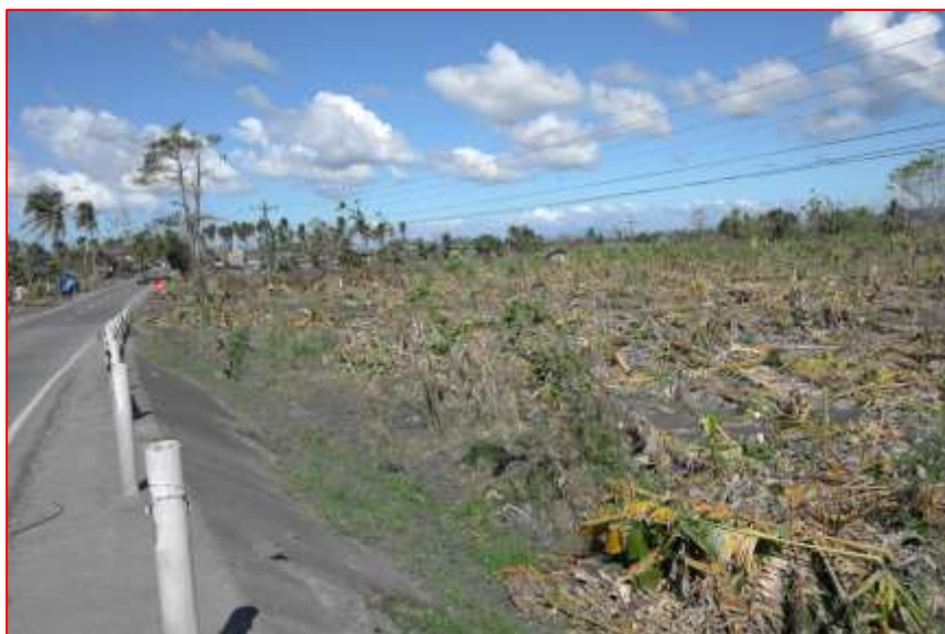
Banana plantation destroyed in the province of Oriental Mindoro.

On 19 December, PAGASA reported rain throughout almost all of the Philippines due to the North-East Monsoon, enhanced by Melor and Twenty Three. Widespread flooding and landslides worsened the situation for many farming communities, some still recovering from October's Typhoon Koppu which affected the same areas.