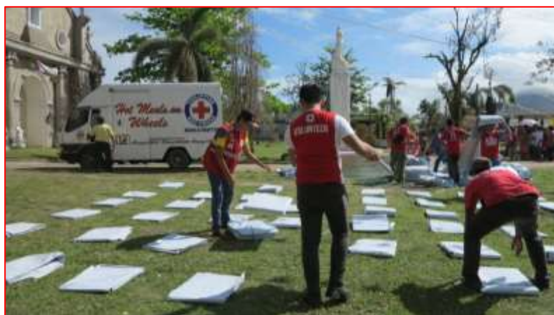
PRC distributes essential household and emergency shelter items in Northern Samar.

PRC and IFRC are currently planning the provision of unconditional cash grants to affected families, to be disbursed through a suitable remittance service provider already contracted. Beneficiary selection is set to start during the second week of January.