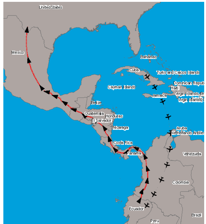
Image to the right: Migration route used by Cuban migrants to reach the United States.

While 1,523 people have been reached through PSS activities, the number of migrants arriving at the border is much higher than the number of migrants actually leaving. The 6,000 migrants currently in Costa Rica and the 2,000 coming in from Panama are expected to pass through the collective centres, so the goal is to be able to provide them with this service and therefore reduce the negative consequences of their overall situation.