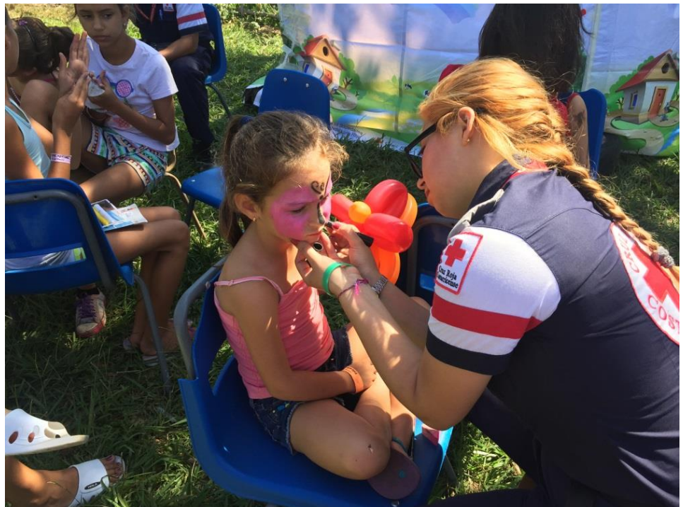
Psycho-social support for vulnerable children in the Collective Centre of La Cruz, Costa Rica, December 2015

January 2016: Emergency Appeal launched for 642,202 to reach 5,000 vulnerable people.