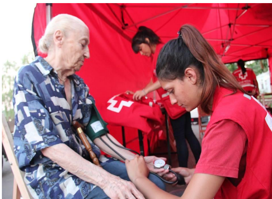
A Red Cross volunteers provides first aid care to an elderly woman in the health post set up in the Velez Sardfield district, located in the city of Concordia (Entre Ríos province). Source: ARC, 10 January 2016.

of Entre Rios, Formosa, Santa Fe, and Corrientes receive appropriate assistance in a timely, effective, and efficient manner and are supported to recover with increased disaster resilience. The operation takes into