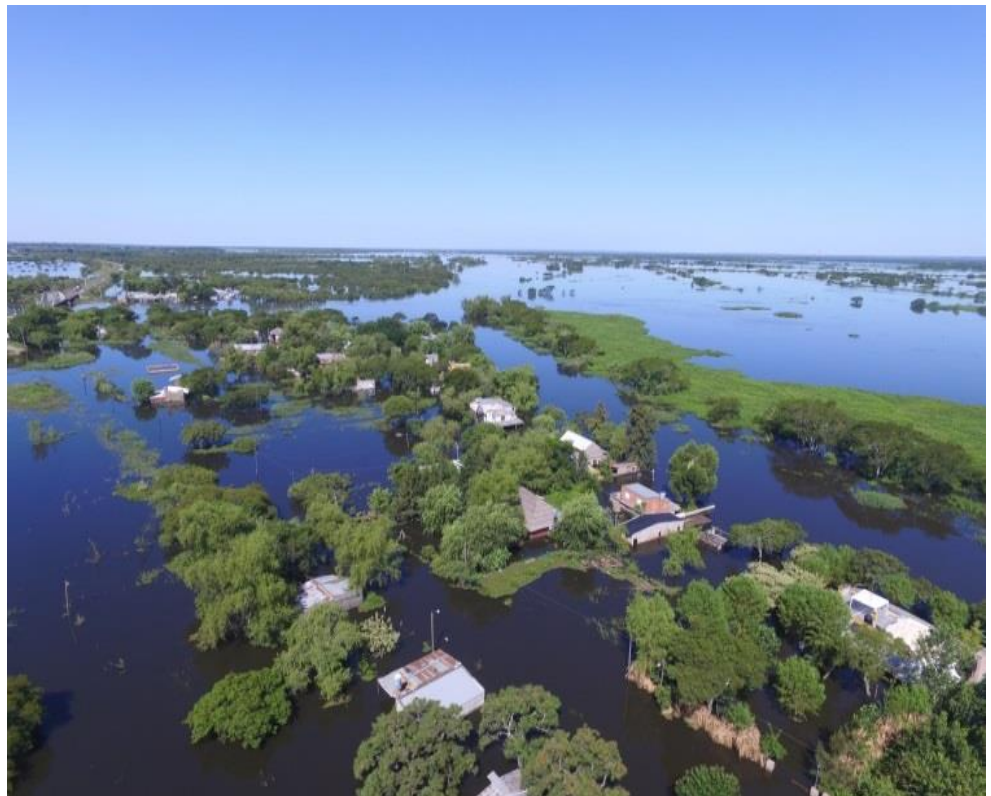
Aerial view of Santa Fé which shows the overflowed Paraná River, where more than 3,300 people have been affected.

20 January 2016: Emergency Appeal launched for 1,006,132 Swiss francs to reach 23,000 flood-affected people.