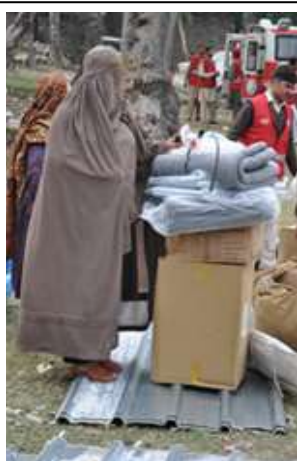
Detailed assessments were carried out by PRC to reach the most vulnerable people affected by the disaster.

The PRC immediately mobilised its trained staff and volunteers at each tier to respond to the critical situation. As part of this DREF Operation, the PRC assessment teams visited the worst affected areas in Khyber Pakhtunkhwa and Gilgit Baltistan to assess the damages and the emergency needs.