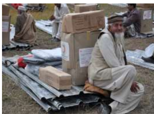
Within two weeks of the earthquake, 1,940 families in Khyber Pakhtunkhwa and Gilgit Baltistan received relief items from the PRC.

On the afternoon of 26 October 2015, an earthquake of magnitude 7.5 struck North West Pakistan. With the epicentre in a remote part of the Hindukush mountain range, the tremor was felt in Afghanistan, Pakistan and parts of northern India.