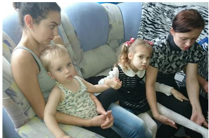
A family from Gorlovka, Donetsk region, is awaiting Red Cross assistance to cover the surgical operation of a disabled daughter so that she could walk again by herself.

With ICRC's financial support of EUR 371,236 Belarus Red Cross supplied 6,224 vouchers for food and household items in two distribution rounds to 4,273 most vulnerable families in November and December 2015. Prior to the operation, ICRC/ IFRC delegates assessed beneficiary needs and helped Belarus Red Cross with the development of the system of distribution, monitoring, reporting, and a complaint mechanism. Vouchers have been distributed among the following categories of displaced people from Donetsk and Lugansk oblasts of Ukraine: pregnant and nursing women (with children under 3 years old), large households with three or more children under 18 years, single-headed households with children under 18 years, pensioners and disabled people. Distribution was carried out according to the family size (1-2 members – one voucher, 3-4 members – two vouchers, 5 members and more – three vouchers). The value of one voucher was BYR 1,000,000 (CHF 50). The voucher was divided into notes of BYR 200,000 so that beneficiaries could go shopping several times.