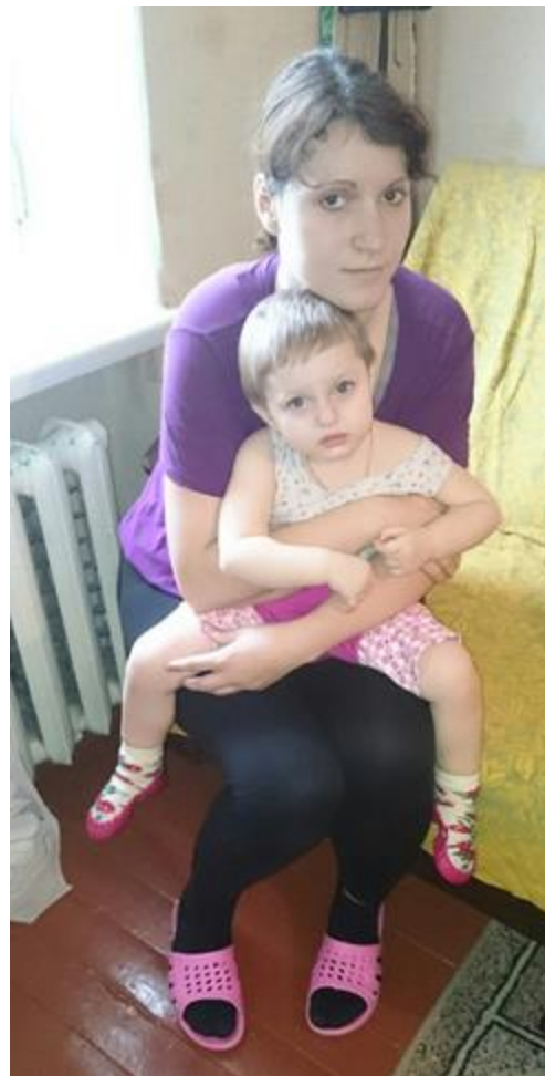
This single mother from Kramatorsk, Ukraine, pins her hopes for survival with the Red Cross: “No place to return to.”

As an auxiliary to the public authorities in the humanitarian field, the National Society provides high quality services within its core Red Cross mandate and plays an essential role in advocating humanitarian needs of the vulnerable people and the communities. Belarus Red Cross’s programmes specifically focus on marginalized or excluded groups to reduce the existing discrimination and exclusion.