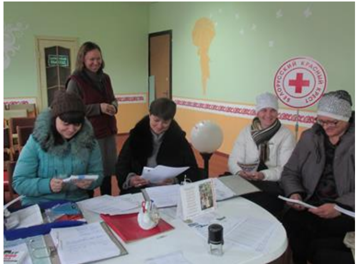
Distribution of vouchers to the most vulnerable displaced families in Kalinkovichi, Gomel region, Belarus.

Since the arrival of the first groups of forced migrants from Ukraine in June 2014, Belarus Red Cross has been responding to the needs of the most vulnerable displaced people by its emergency cash fund and distributing household items from its disaster preparedness stocks. The distribution of essential food and non-food items has been effected through the well-established voucher distribution system. In addition to one-off humanitarian assistance, Belarus Red Cross has provided referral, counselling and psychological support services, temporary accommodation, and subsistence to travel and medication