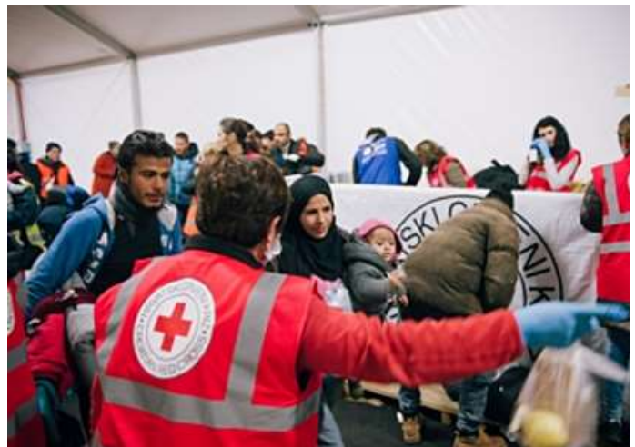
Slavonski Brod transit camp in Croatia. Croatian Red Cross volunteers assist the arriving people who are then directed to busses heading for registration. After registration almost all migrants continue to Slovenia. Volunteers provide migrants food items and warm winter clothes.

● 9 February 2016 : an Emergency Appeal is launched for CHF 2,601,799 to assist 175,000 beneficiaries to continue the support that the National Society was providing to the migrants through the DREF allocation for a further six months. Additional activities are included in this Emergency Appeal, as it is anticipated that more migrants will be arriving in the coming months.