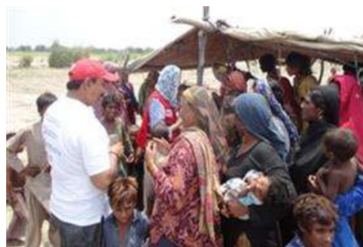
Damage and needs assessments being carried out by PRC in Punjab.

During this reporting period, the PRC continued to monitor the situation. Based on the changing needs on the ground and the resources available, a revised plan of action was developed and published in December 2015. The key components – provision of food, emergency shelter and household items, emergency health care services and replenishment of disaster preparedness stock remain. However, the target population has been scaled down.