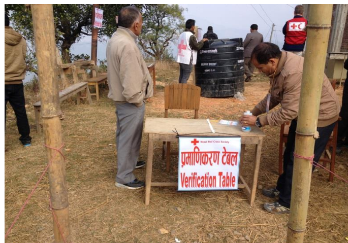
Preparations of distribution site in Gorkha during December 2015.