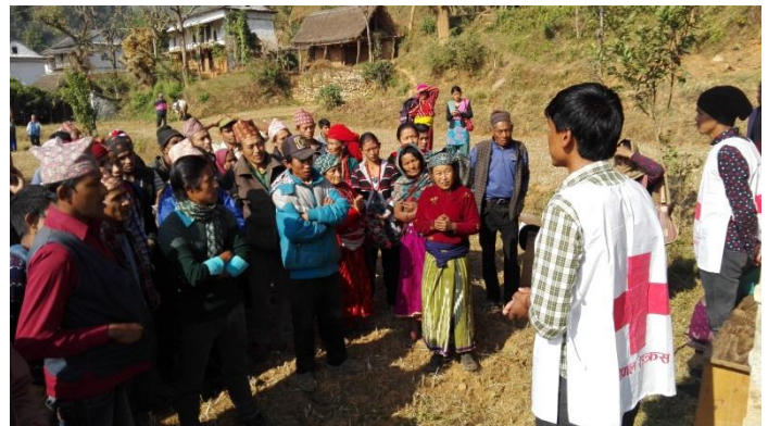
Trained NRCS volunteers informing population about the seasonal support (community engagement and accountability).

A temporary hotline number was also set up to support the seasonal support distributions. The line received 82 phone calls with 100 per cent of the queries being satisfactorily addressed. Fifty seven per cent (57%) of queries were around how to access grant payments. The number for the hotline was shared widely in communities before and during cash distributions, and was also printed on the cash envelopes. Learning from this experience, including the frequently asked questions (FAQs) document developed through running the hotline, is being used to inform the establishment of a permanent Red Cross hotline.