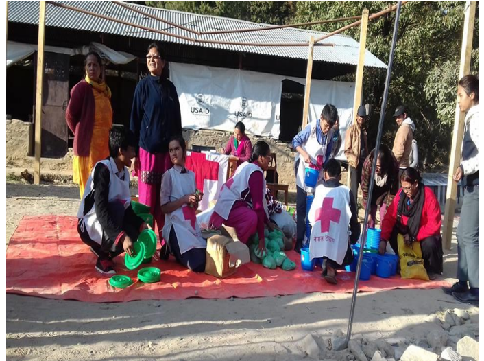
Menstruation kits distribution in a school in Sindhuli district.

NRCS participated in a regional level violence prevention workshop in December 2015 which was held in the IFRC Asia Pacific regional office, in Kuala Lumpur, Malaysia. This workshop was a good platform to share the situation of violence prevention among many countries of the region. After the workshop a concept paper on “violence prevention” was developed. It is expected that the learnings from the workshop will be more useful and relevant to implement violence prevention activities in communities.