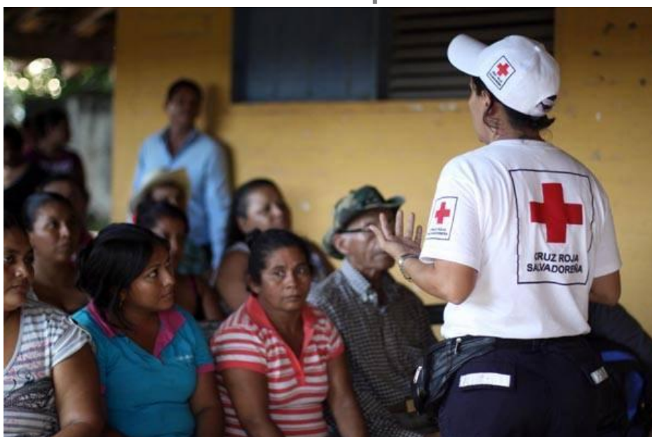
A volunteer of the Salvadorean Red Cross Society talks with the community during the assessment.

February 2016: The IFRC issues emergency appeal for 2,257,946 Swiss francs for 9,020 people with long-term solutions in food security, water and sanitation and health.