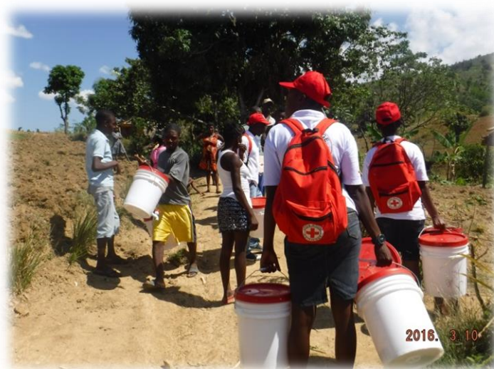
Community Volunteers distribute hygiene products in Belladere, Central Department Haiti.

Project activities in the Dominican Republic were finalized within the original timeframe in December of 2015. In Haiti of the four cholera projects being implemented under the appeal, two will be finalised as of the appeal end