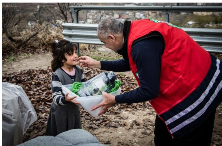
A girl carries relief items including a kerosene lamp distributed by IRCS volunteers

The current appeal coverage is 57 per cent. Funds are very urgently needed in order to support IRCS in providing more humanitarian assistance to those affected by the current crisis. Annexed to this update are the latest interim financial report for this Appeal, as well as the updated Mobilization Table that lists details of the outstanding relief requirements: 149,888 mattresses, 139,950 blankets, 60,200 jerry cans, 27,472 hygiene kits, 23,672 kitchen sets, 23,325 heaters, 21,494 tarpaulins, 4,600 food parcels, 3,800 lanterns, 1,750 first aid kits, 200 rapid latrines, 2 x Watsan Kit 5, and 1 mobile health unit van are very urgently needed.