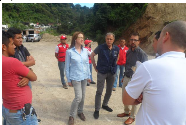
European Commission's Humanitarian Aid and Civil Protection department (ECHO) visits the disaster zone.

The Guatemalan Red Cross trained staff members to meet DREF Landslide requirements and to develop actions to alleviate human suffering. A total of 325 volunteers were mobilized during the operation to meet the needs of the affected population and achieve the requested results. The operation did not foresee having to mobilize regional or global staff.