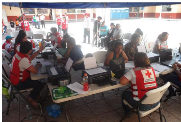
GRC registers beneficiaries for CTP.

It was suggested that the survey should be conducted using the Open Data Kit (ODK) because this technology had been in use for some time, which proved to be useful. Trained personnel uploaded it onto https://www.crg-voluntariado.appspot.com and later downloaded it on Guatemalan Red Cross equipment acquired for this purpose.