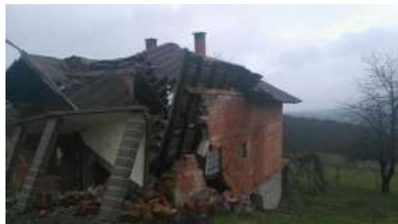
Photo 11: This photo was taken during the post-distribution monitoring visit in Cazin Municipality and it shows destruction some of our beneficiary's properties have suffered. This beneficiary, a single mother, lost her entire property in landslides.