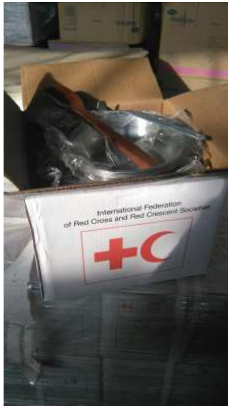
Photo 15: Kitchen set for 5 persons, donation from the IFRC.