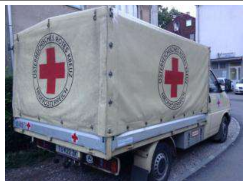
Photo 6: Bilateral support by the Austrian RC for water and sanitation in Brcko District.