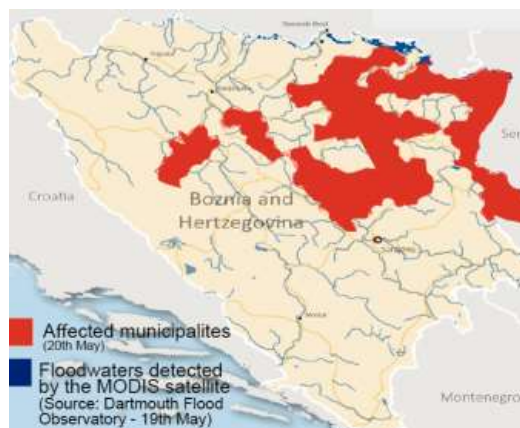
Flood affected areas in Bosnia and Herzegovina

The Red Cross Society of Bosnia and Herzegovina (RCSBiH) has 153 branches, all of which were actively involved in the relief operation. 247 Red Cross staff and 7,082 volunteers were mobilized and were actively engaged in rescue and operation activities, providing relief and helping setting up centres and temporary accommodations for those evacuated. Further to this, the National Society mobilized its multipurpose teams, staff and volunteers, for assisting the authorities with evacuations as well as providing blankets, mattresses, drinking water, food and hygiene kits, rubber boots and water disinfectants to the affected people. In Brcko District, one of the worst affected areas, Red Cross volunteers also assisted by putting out sand-filled bags along the River Sava trying to prevent it from flooding dozens of villages. The relief efforts were hampered by the destroyed infrastructure, broken telecommunication, blackouts and difficult conditions in the field. During the previous years, the Red Cross Society