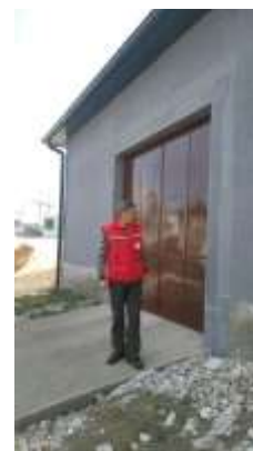
Photo 13: RS RC employee in front of the fully refurbished warehouse in Pale.