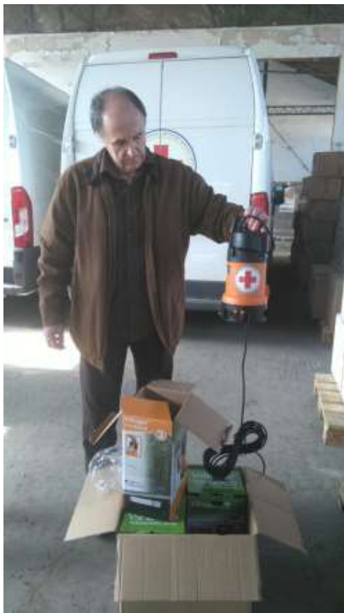
Photo 18: One of the received mud pumps, presented by the warehouse manager. In the background, the two new vans donated to the RCSBiH.