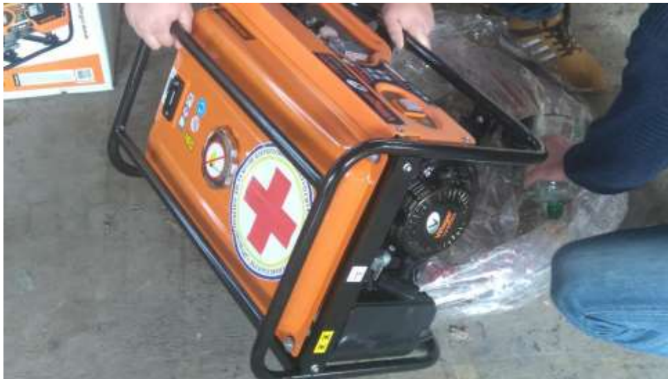
Photo 17: One of the 20 generators donated to the RCSBiH.