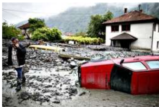
Photo 2: Destruction during the floods was incredible.