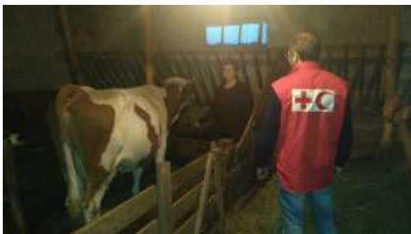
Photo 10: A beneficiary from Laktasi Municipality showing a heifer she bought from the cash received from the IFRC.