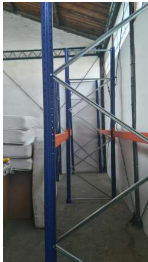
Photo 19: New shelves installed at the RCSBiH warehouse in Sarajevo.