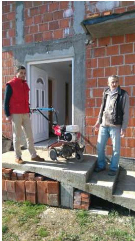
Photo 9: A beneficiary from Srbac Municipality with RC Srbac branch staff member showing the motor cultivator that he bought using the donation from the IFRC.