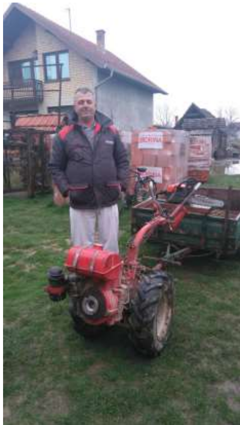
Photo 8: A beneficiary in Brcko District showing a second-hand motor cultivator and a trailer he bought using funds donated by the IFRC.