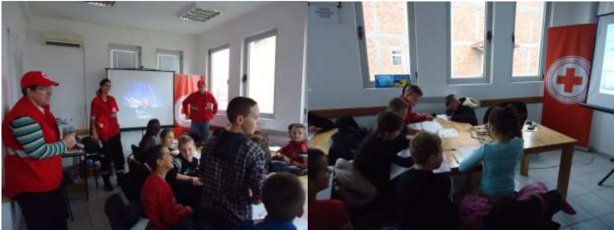
Photos 4 and 5: Psycho-social support for children in Brcko District. Workshop.