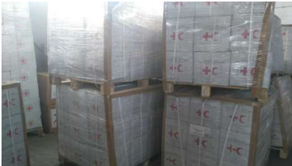
Photo 16: Prepositioned stock, donated by the IFRC, stored at the RCSBiH warehouse in Sarajevo.