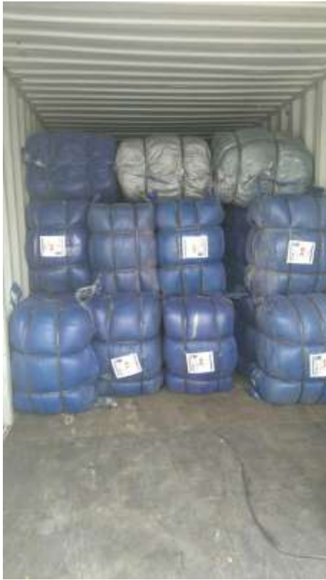
Photo 14: Blankets received from the IFRC as prepositioned stock at the RCSBiH warehouse.