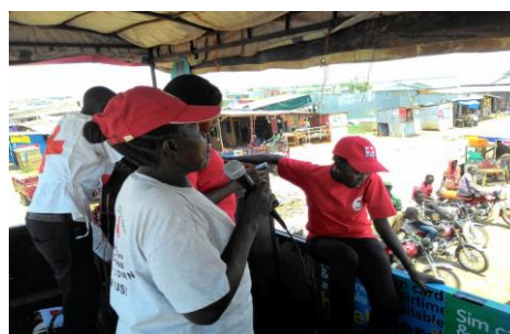
The DREF operation supported SSRC's social mobilization campaign, reaching almost a quarter of a million people during the cholera outbreak.

On 3 November 2015, 4 ½ months after a cholera outbreak was declared on 23 June 2015, the Government of South Sudan, through its Ministry of Health, declared an end to the outbreak 2 . At final tally, the emergency recorded 1,818 laboratory-confirmed cases and claimed 47 lives in Central Equatoria State and Jonglei State 3 . Juba County in Central Equatoria was, by far, the most-affected, accounting for 89 per cent (1,622) of cases in 7 payams 4 .