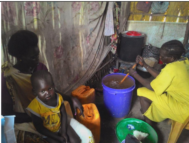
A woman at New Site shows a monitoring team the process of purifying water, as demonstrated earlier by SSRC volunteers during household visits.

Transmission rates were not independently measured at the targeted locations. All data on transmission relied on Ministry of Health/WHO Cholera Situation Reports, which received data from official cholera treatment centres (CTCs) around Juba. However, SSRC monitoring visits to CTCs serving its intervention areas found that some cases registered and treated were not reflected in the official data but could not determine if this was because of stricter confirmation tests (such as laboratory positive testing which is not conducted at CTC level) at national level. In any case, SSRC's informal strategy was to conduct follow-up visits with public awareness campaigns in areas reporting new cases of cholera as discovered by monitoring visits to CTCs.