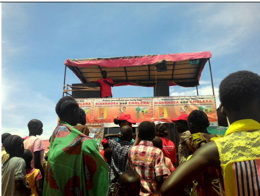
Members of the public gather round the SSRC mobile stage to listen during a public awareness session.

The sheer number of beneficiaries reached by a relatively small group of volunteers served to demonstrate the commitment and dedication shown by the volunteers of Juba branch. In recognition of their efforts, SSRC and IFRC, supported by Swiss Red Cross, held a recognition ceremony at the SSRC headquarters on 21 November, awarding certificates to outstanding volunteers.