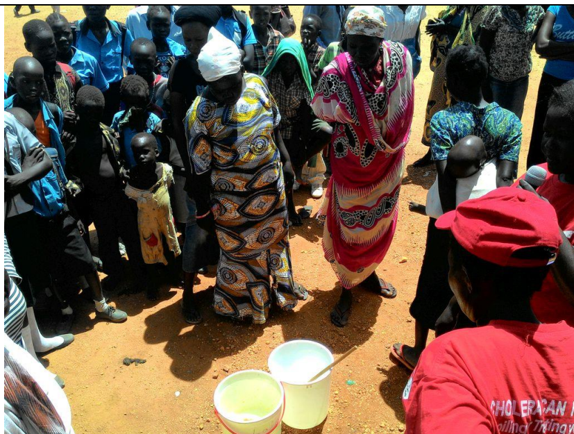
Many of the beneficiaries saw the use of PUR for the first time, like in this instance during a public awareness session.

Giada, 3 were installed at the Giada Model Primary School. An additional facility was also installed at the SSRC Juba branch compound for daily use of the volunteers returning from the field. Austrian Red Cross provided technical support for WASH assessment and trainings, including water quality testing.