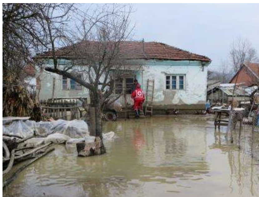
Relief distribution in the village of Sirca by Kraljevo RC branch volunteers.

Pozega municipality declared a state of emergency on 6 March due to flash flooding caused by the spill-over of the rivers Skrapež, Western Morava and Moravica. The floods have affected seven villages and the outskirts of the local community Tatojevica. In the northern part of the municipal territory at least six villages were left without electricity for several hours. The municipality has a total of 29,488 inhabitants, of which nearly 5,000 have been affected. At least 100 households have been flooded and approximately 1,000 hectares of farmland has been also affected. The flash floods caused landslides, and at least thirty families had to be evacuated and temporarily accommodated with relatives and friends.