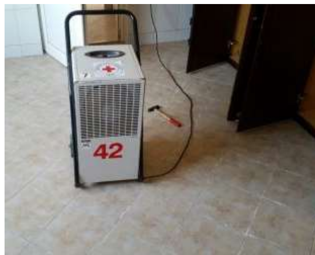
Dehumidifier being used in Novi Pazar.

The field assessment teams and trained RCS field personal at the RC branches identified the following needs of the affected population: emergency food distribution including canned food for those evacuated and temporarily sheltered to support their nutrition needs while the people, up to 1,100 families, are out of their homes. Three water tanks, 1,500 litres each, were placed in the closest locations to people's houses as to support their urgent water needs until the public water system was restored. The assistance was soon followed by the distribution of hygiene parcels and other non-food items (rubber boots and raincoats) as identified during the field visits. The following week after the floods, wall dehumidifiers, in total 55 pieces, were sent from the RCS's disaster preparedness stocks to five municipalities Lucani, Cacak, Pozega, Arilje and Novi Pazar and have been put at the beneficiaries' disposal until 30 April 2016.