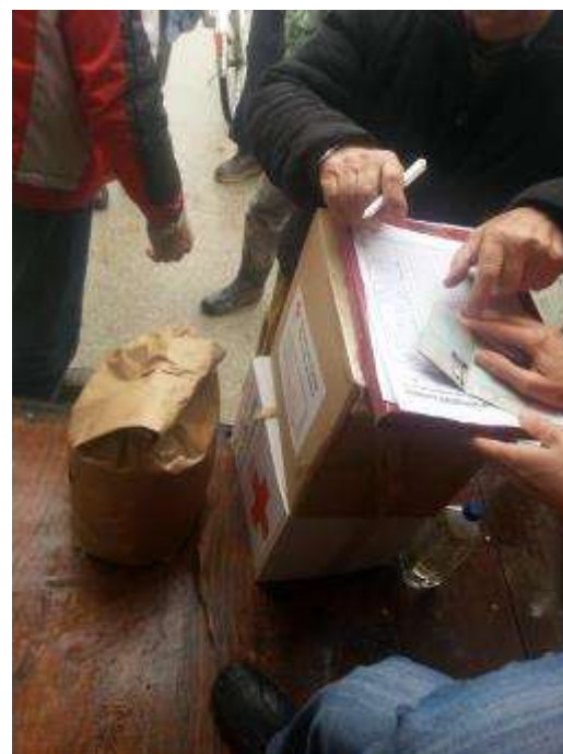
Distribution of relief items in Cacak.

All Red Cross activities have been coordinated with the Department for Emergency Situations of the Republic of Serbia. Operational Headquarters of the Government of Serbia introduced duty work around the clock in the most critical days, and the Red Cross of Serbia was part of that. Municipal commissions were established, which went out