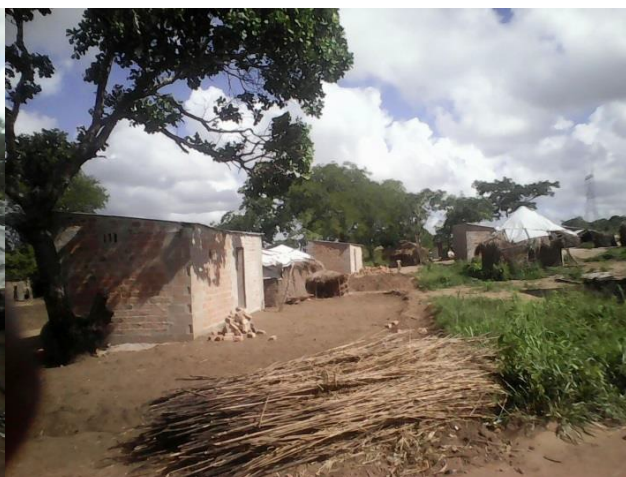
Completed houses in Mudiba