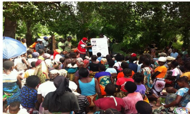
Shelter Tool kit instruction session by CVM staff

The final quantity of NFIs distributed, especially shelter tool kits, was less than initially planned for some items since the need was partially covered by other organisations on the ground such as COSACA, IOM and World Vision. As seasonal disasters are common in Mozambique, the CVM maintains pre-positioned stocks of non-food items in different provinces of country as part of their emergency preparedness plan. The remaining items are now part of CVM's emergency preparedness stock. An overview of the items distributed can be seen in Table 5.