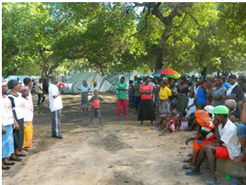
CVM volunteers were conducting a health and hygiene awareness session in Cajul Accommodation Centre, Mocuba.