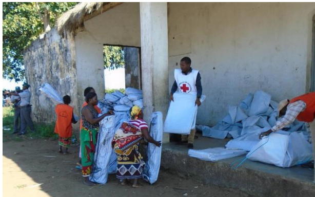
NFIs distribution in Namacurra, Zambezia

CVM began the distribution of pre-positioned non-food items (NFIs) at the end of January. The distributions took place at the collective shelters and the resettlement communities in the districts listed in Table 1. The beneficiary selection was done together with the local authorities and community leaders. To ensure coordination and avoid duplication, the Red Cross communicated its activities continuously with the National Disaster Management Agency (INGC) and clusters members. 3,524 households received assistance in the form of NFIs, combined with relevant trainings on how to use the shelter tool kit and health and care issues.