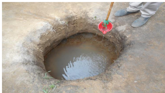
Open well in Mudiba, Mopeia (before)

In order to sustain constructed boreholes in two communities of Mudiba and 1 de Maio, five water committees have been established and trained in how to operate, maintain and repair in case of technical failures. All five committees are well received and respected by the whole population.