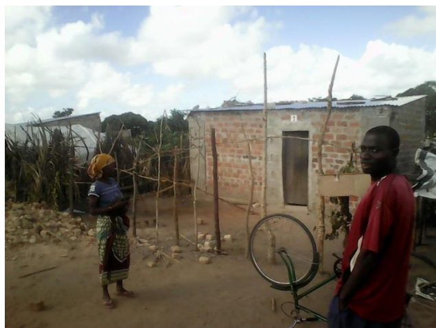
A completed house in 1 de Maio

660 bags of cement to the Danish Red Cross project to enable 110 houses in Mudiba to be completed. It is a good success of working and supporting each other in the field especially shelter construction in these two communities.