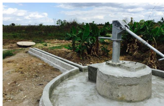
Borehole in Mudiba, Mopeia (after)