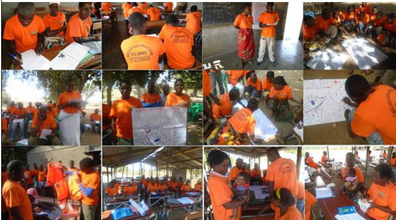
CBDRT trainings in Mopeia

A two day training jointly facilitated by CVM and INGC in five communities were completed and during the training CBDRT members got familiar with the use of response tool kit. The kit consists of more than 20 different items such as bicycles, stretchers, megaphones and solar radios.