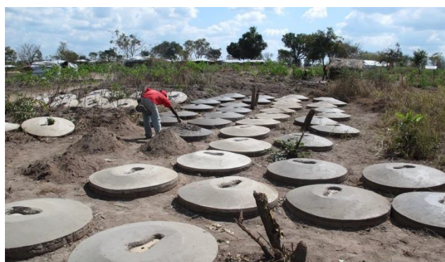
On site production of latrine slabs.

As mentioned in the health section of this report, hygiene education reached 225,416 people in Zambézia, Tete, Niassa and Nampula provinces. In addition, volunteers monitored latrines and water points, purified water and collected samples for laboratory testing by the MoH.