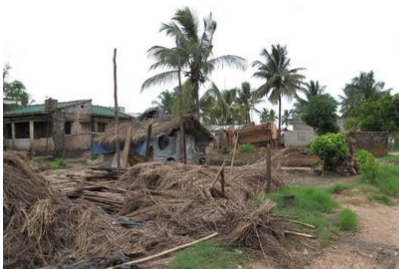
Houses were destroyed in Lugela, Mocuba district.

From November 2014 until late January 2015, Northern and Central parts of Mozambique experienced extensive rainfall which caused serious flooding in many regions. The most critical area affected was in the centre of the country, precisely in the Licungo River Basin (Zambezia province). Floods here reached historical levels (in some areas up to 12m height). On 12 January 2015, the Council of Ministers of Mozambique declared the institutional red alert for the Central and Northern parts of the country due to heavy rains recorded and consequent floods in large areas. Flooding affected communities, public and private telecommunications and energy infrastructures, especially in Zambezia and Nampula provinces. Land transportation was hindered, with many roads and bridges destroyed or completely flooded. The main national road N1 was cut multiple times, mainly in Mocuba and Gúruè districts. Many communities including those around Mopeia and Maganja da Costa were completely isolated and only accessibly by air. Electrical infrastructure and communication were severely impacted. In the North, damage to power-plants left the second largest city of the country, Nampula, without electricity for several weeks. Water supply systems were damaged in many areas making access to safe water difficult.