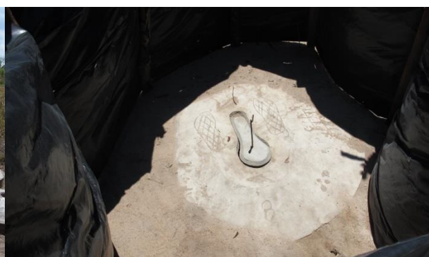
Concrete latrine slabs are in use in 1 de Maio.