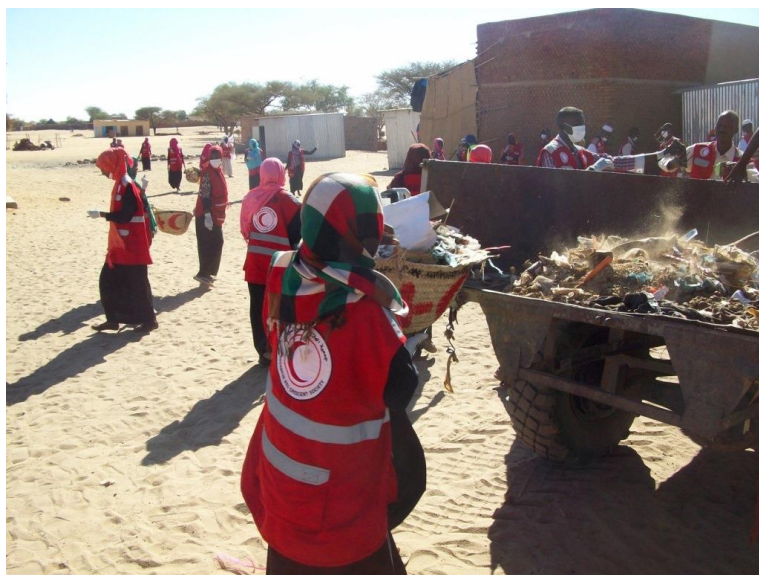
Photo: SRCS volunteers conducting clean-up campaign in North Darfur

SRCS branches also worked with and supported MoH campaigns against measles, malaria and dengue fever. The campaign also targeted host communities as well as IDP and refugee camps. The campaigns were conducted in collaboration with state public health office. In Darfur, a total of 523 suspected Dengue fever cases including 128 deaths were reported in the period of August - December, 2015 3 . Measles outbreak started in December 2014 and affected 11 localities of Kassala and Gedaref States by January 2015. In April, the outbreak was reported in additional 28 localities in Kassala, Sennar, the Red Sea, West, East, and North Darfur states. SRCS volunteers were involved in mobilizing communities and supporting vaccination campaigns conducted by MoH 4 .