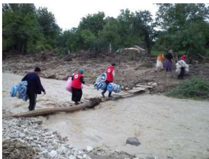
Russian Red Cross Local Disaster Response Teams delivering household items in the area affected by the floods.

On 4 June 2016, as a result of heavy rains, the levels of water rose above critical point in the river "Parul Ozen". In the villages of Arkas and Nizhni Djentgutai, several houses were partly or fully destroyed. Stocks of food, gardens, orchards, crops, barns and chicken coops got damaged, household items (furniture, appliances, clothing, footwear, utensils, documents, cash savings, etc.) were lost or went missing just like farm animals, poultry and cattle. Much of the local infrastructure such as health facilities, roads,