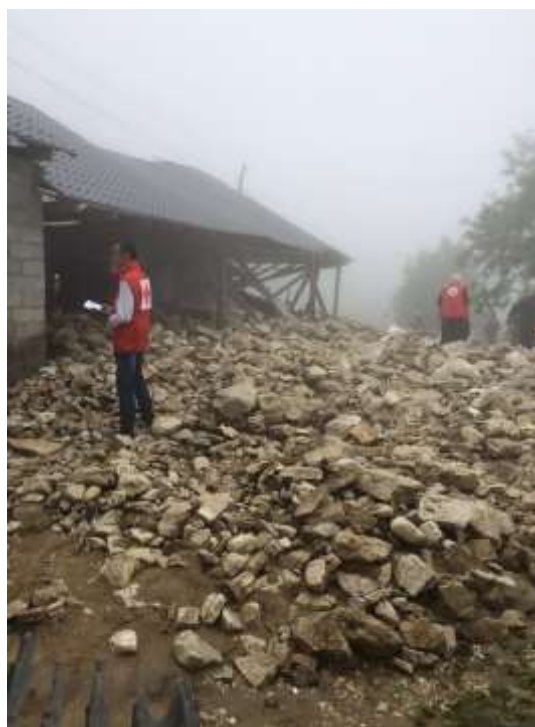
Russian Red Cross Local Disaster Response Teams conducting needs assessment in Dagestan.

The IFRC Secretariat has a Regional Representation in Russia, based in Moscow, which provides technical and advisory support to the Russian RC at HQ level in its capacity building programs and disaster situations. The Regional Representation ensures an overall coordination with the Russian RC and ICRC to render effective assistance to the affected population. ICRC has a Regional Delegation in Moscow with its sub-delegation in Chechnya and an office in Kabardino-Balkaria providing capacity building support to the five branches in the region (Kabardino-Balkaria, Ingushetia, Chechnya, North Ossetia and Dagestan) in the field of emergency preparedness and response, first aid and dissemination of humanitarian values and fundamental principles. The Chechen branch is involved in an operational partnership with ICRC to collect data on mine victims and to provide psychosocial support to the families of missing persons.