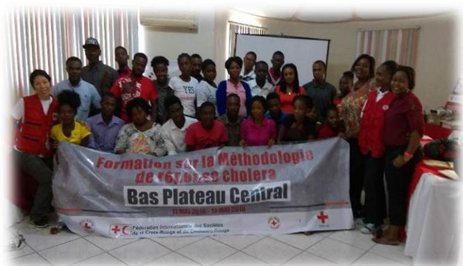
Photo 1: Training session conducted on the cholera response techniques, control and epidemiological surveillance-May 2016

This project will end as of on 30 June 2016. Response activities have been marked by trainings and community responses in the areas of Lascahobas, Savanette and Belladère where confirmed cholera cases/outbreaks were identified, particularly in the locality of Pouly, a town in the Commune of Lascahobas. In order to prevent further