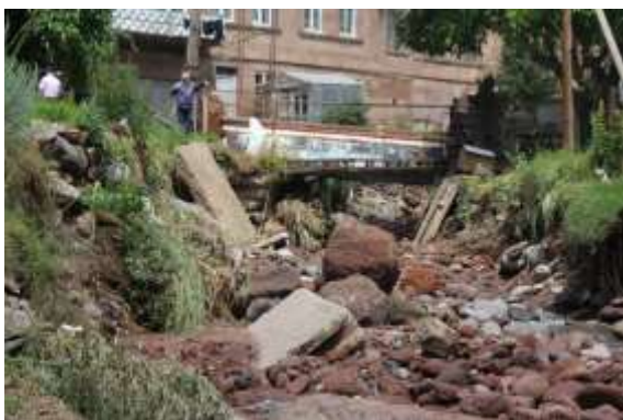
Rapid needs assessment in Artik city.

According to the local authorities' estimates, 12 households have been seriously affected by the disaster and another 30 households have indicated medium level losses. The regional and local authorities responsible for relevant operations are fully engaged in providing assistance to the population. Special equipment and machinery from the region have been mobilized in the city of Artik. According to a rapid assessment report, there are many volunteers among the residents who are engaged in response activities helping people clean their yards and homes from the mud, dirt and stones.