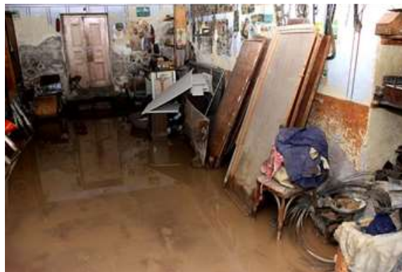
Affected house in Artik city

The Emergency Situations Governmental Commissions were activated for conducting an assessment of the damages in both locations. The Prime Minister of the Republic of Armenia, together with the respective Ministers of Emergency Situations, Territorial Administration and Development and Urban Development visited Artik city on 25 June in order to understand the scope of disaster and assess the operative situation and the scale of damages caused 2 . The next day, the Prime Minister called for an emergency meeting to discuss the final outcomes of local Emergency Situations Commissions' assessment findings and measures to be undertaken by the Government. It was decided to provide financial support to the suffering people in Artik city for the recovery of their homes. Also, the regional Rescue Services and regional authorities were actively involved in the response operations providing all necessary assistance and ensuring coordination. It is worth mentioning that the Artik Municipality is offering the affected people temporary shelter until the situation is solved. At the moment, however, the affected people are refusing to leave their damaged homes.