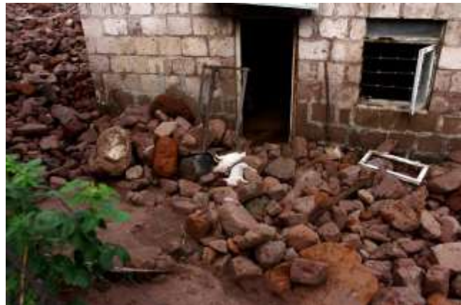
Affected house in Artik city.

The Disaster Management of the Armenian Red Cross Society (ARCS) has developed significantly during the recent years. The NS is currently one of the leading organizations in the country in this field. It has strengthened its capacities in Community Disaster Risk Reduction (DRR) and its institutional preparedness and response. ARCS is considered by the Ministry of Emergency Situation as a leading actor in DRR and has signed a Memorandum of Understanding (MoU) with that Ministry for coordinating their joint efforts in disaster response and DRR. The NS is a member of National DRR Platform and is involved in different working groups, even leading some of them. The National Society has two IFRC Regional Disaster Response Team members. It has an emergency stock for around 500 families to provide temporary shelter in case of a large scale disaster. The NS also has a disaster response and contingency plan developed in the year of 2007 and revised in 2015 for an eventual earthquake scenario. The NS DM & PM department consists of 16 people including the staff in the branches. Some 350 active volunteers are involved in DM activities countrywide.