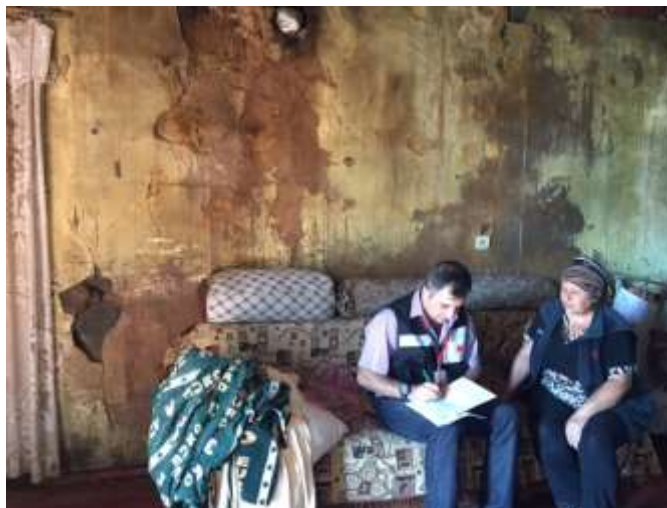
Rapid needs assessment in Karchaghbyur village.

The ICRC is working closely with the NS in the fields of Mines Risk Awareness-raising, Restoring Family Links (RFL) and Dissemination. The Danish Red Cross and the Austrian Red Cross are represented in the country through assigned delegates coordinating programs such as "Building Safe Communities in Southern Caucasus", "Building Resilient Local Communities in Armenia and Georgia", "Climate Forum East II", etc. Those projects are supported by their Tbilisi offices in Georgia. In 2016, Swiss Red Cross opened an office in Armenia with a local delegate for strengthening cooperation with ARCS and implementing joint projects. There is no IFRC country office in Armenia.