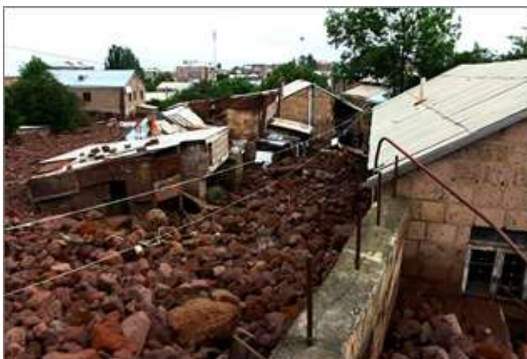
Affected houses in Artik city.

Karchakhbyur village is located 30 km away from the border with Azerbaijan in a remote and isolated area of Gegharqunik region, which is one of the poorest regions in Armenia. 1 The total population of the village is 2,518 people or 752 households. People in the village are mainly involved in potato growing and cattle breeding.