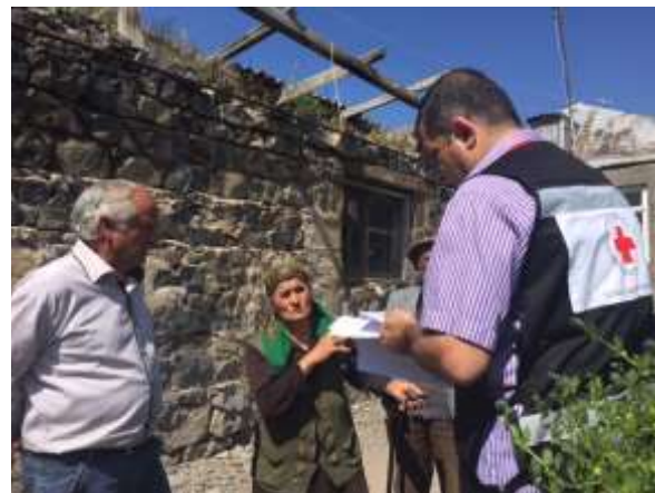
Rapid needs assessment in Karchaghbyur village.

Then ARCS made a decision to activate its Rapid Response Team for organizing a rapid needs assessment in the affected areas in order to define the consequences and the need for its involvement in the operation. The activated team has agreed on the structure and methodology for conducting an assessment in order to identify the people's basic needs, the scope of damages and to establish formal