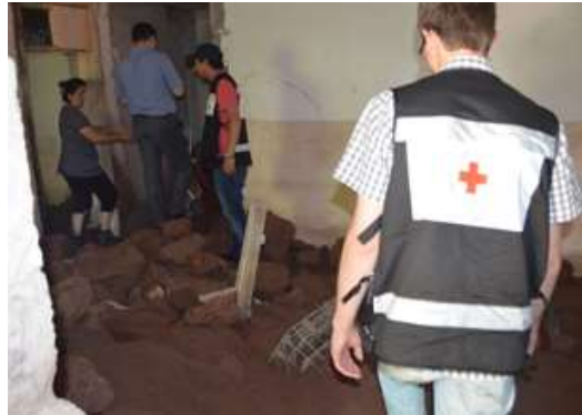
Needs assessment by ARCS staff. In Artik city.

Having in mind the possibility of heavy rains forecasted for most regions, there is a risk that the same or even worst situation might happen in many regions and communities so that the assistance to the current two communities might be insufficient.