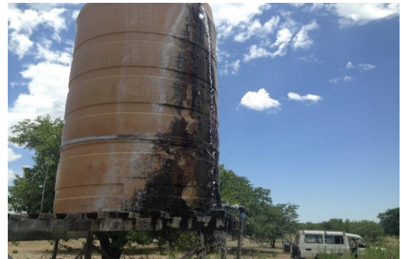
Community water tank for rehabilitation.

Due to funding limitations, the national society made a decision to focus on a few soup kitchens, to avoid spreading resources too thin and be able support identified beneficiaries over the entire lean season. The in-kind donations sourced from local companies resulted in savings made on the operation, and is complementing the resources received from international partners. The beneficiaries remain vulnerable due to continuing drought in the country.