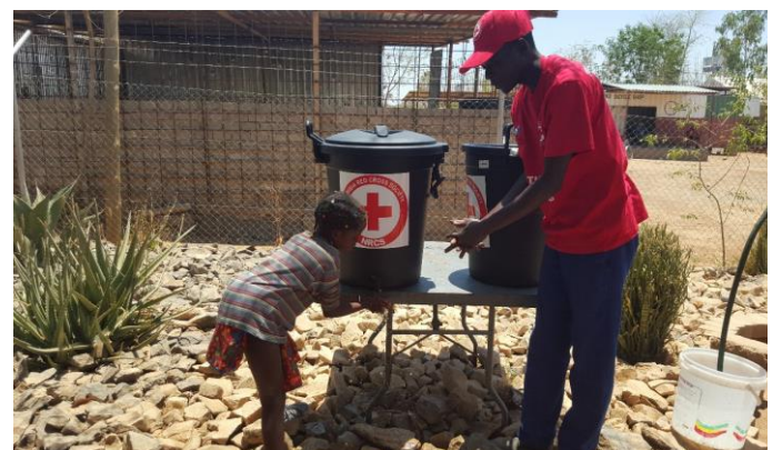
An NRCS volunteer teaches hand washing to a beneficiary of the food assistance programme at Opuwo office soup kitchen

To promote safe hygiene practices, the NRCS delivers Water and Sanitation (WASH) education at soup kitchens during food distributions. This approach helps reduce the potential for communicable disease transmission and infection by ensuring that safe hygiene is practiced prior to eating. An estimated 1,185 beneficiaries in Kunene and Kavango have been reached this way and volunteers continue to engage with beneficiaries.