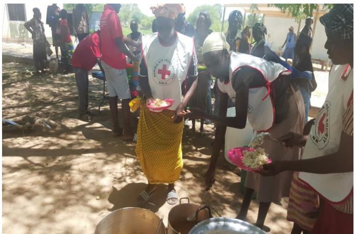
Meals Provision at Kavango Soup Kitchen.

To increase the operation's visibility, the NRCS conducted a media tour in February 2016. Field visits were conducted with local journalists and led by the NRCS' Humanitarian Diplomacy/Communications Manager and the Secretary General. The media tour was aimed at highlighting the food insecurity situation in Kavango, Kunene, Oshikoto, Ohangwena and Zambezi—the regions targeted through EPoA. From this, a number of stories were published in the local newspapers and on the IFRC website. A second media tour was conducted for a Communications Specialist from the Norwegian Red Cross Society, which sought to highlight the drought's impact on crops as well as profile the NRCS' soup kitchen operations in Kavango region. The stories and communication materials as result of this mission are in the final stages of development and will be shared widely once they have been completed. Finally, to increase the visibility the operation, the NRCS procured t-shirts, overalls, aprons, and bibs for volunteers working at the soup kitchens in Kunene and Kavango,