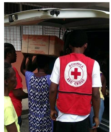
DRCS distribution in Dubique.