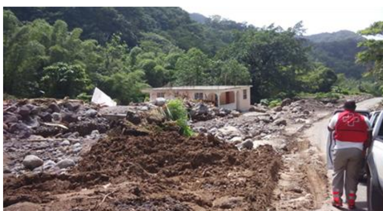
Destruction in Grand Bay, Southern District.

The island of Dominica sustained significant damage due to the passage of Tropical Storm Erika on Thursday, 27 August 2015. A band of torrential rain caused by the system resulted in 12.64 inches of rainfall in less than twelve hours and triggered massive flooding and several landslides. Regional governments and the Caribbean Disaster Emergency Management Agency (CDEMA) stepped in to help Dominica after recording the loss of lives. According to CDEMA Situation Report No.10 1 , approximately 1,070 users were without electricity and all 44 of the water systems in the country were affected, cutting off the water supply for the majority of the population. Telecommunication services were restored quickly and the 3 hospitals and 43 health centres remained operational. The main airport was closed as it suffered damages, but it was reopened and operational two weeks after the event. The Canefield airport, a secondary facility, remained operational for helicopter and small aircraft use.