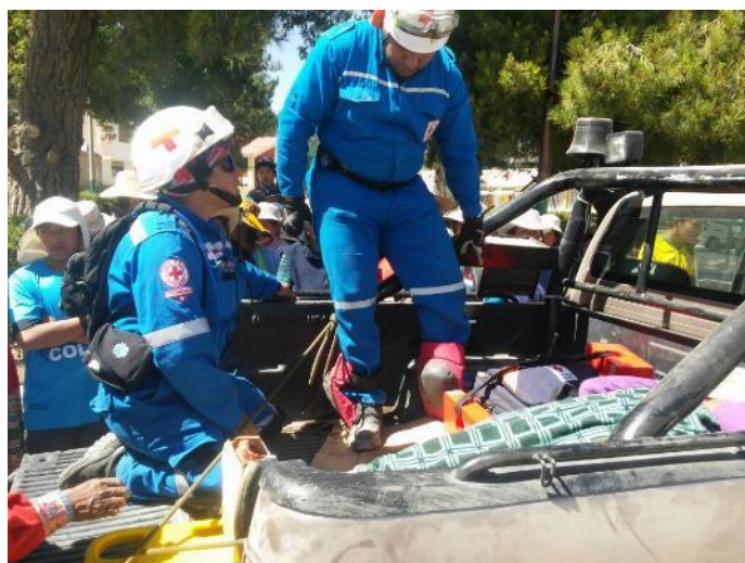
The PRC provides medical care and evacuates the injured.

In view of additional needs, the National Society decided to request a DREF in order to be able to provide additional support to up to 1,000 vulnerable families in the province of Caylloma in the Arequipa region, of which all of the families will receive PSS, 100 families will receive humanitarian relief and 100 will receive temporary shelters; the materials mobilized by the National Society for 500 families will be replenished by the DREF.