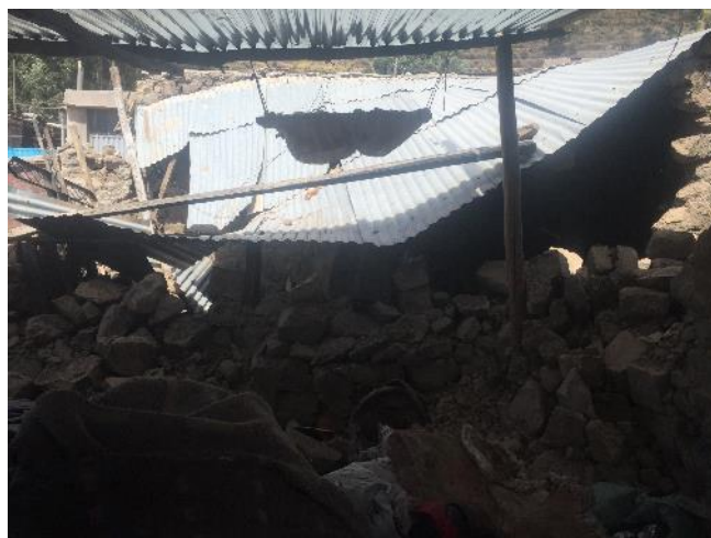
Collapsed houses in the city of Achome.

Medicine kits for trauma and acute respiratory infections will be sent to the cities Chivay, Achoma, Maca, Ichupampa and Yanque, which were the hardest hit and where most of the damage has been reported. For now, those wounded are in stable condition thanks to the rapid intervention of MINSA and Regional Health Management (GERESA) staff in the region. Currently, all health centres in these municipalities are functioning.