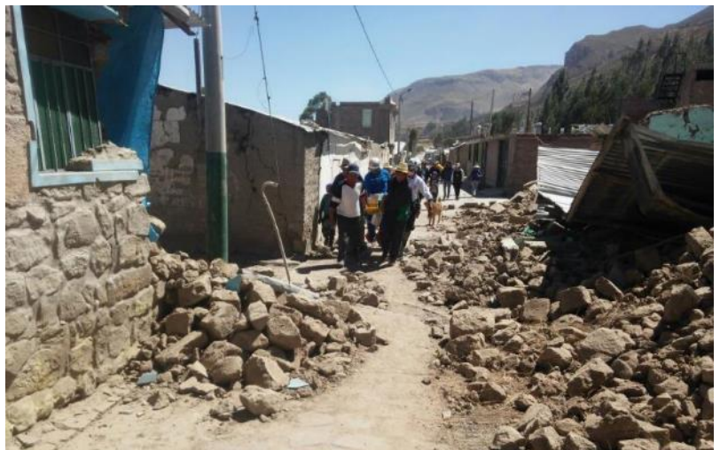
Evacuation of injured people by Red Cross brigades in Yanque.

Madrigal, Tapay and Lari. According to preliminary reports from 21 August 2016, 11,115 people have been affected, 158 homes collapsed, 1,173 were rendered uninhabitable, 1,277 suffered damages, 13 schools were affected, 67 people were injured and 4 people were killed.