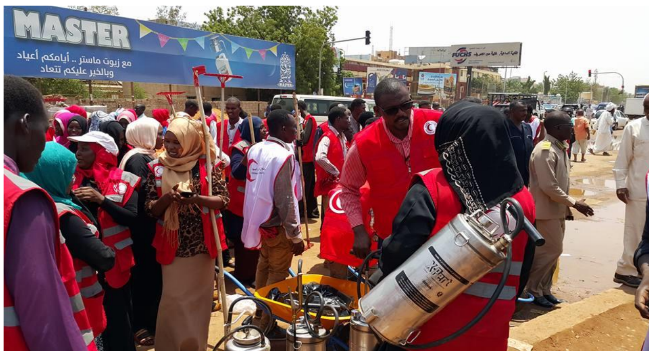
SRCS Volunteers conducted Vector control and environmental cleaning campaign.