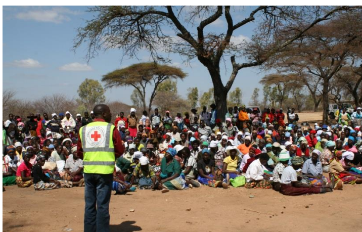
The Zimbabwe Red Cross Society conducts a beneficiary selection in Mudzi district, northern Zimbabwe for the cash-transfer component of the Appeal.