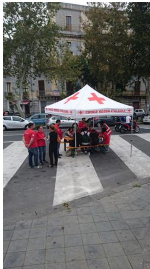
The Italian Red Cross staff providing services in one Safe Point in Catania.

In addition, as mentioned above, health care services are also provided in the structures / centres supported by the Italian Red Cross, such as the largest centre in Europe for asylum seekers and refugees, the CARA of Mineo in Sicily (with an approximate population of 3,600 people as of the end of September).