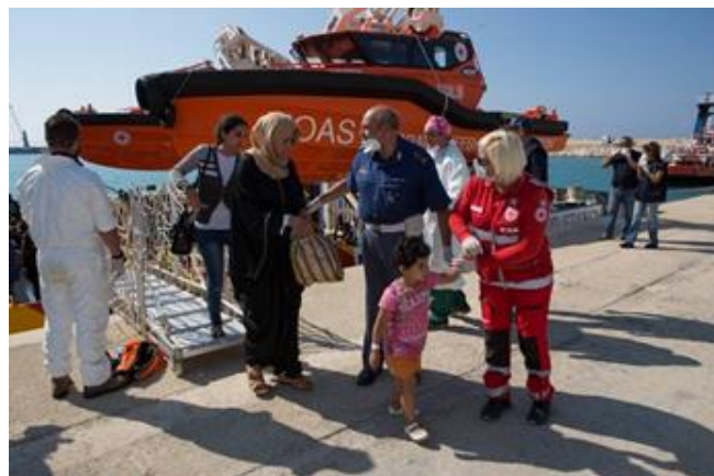
The Italian Red Cross staff receiving migrants at shore.

From the beginning of the operation to end of September 2016, the Italian Red Cross has provided the following relief items and services to migrants: