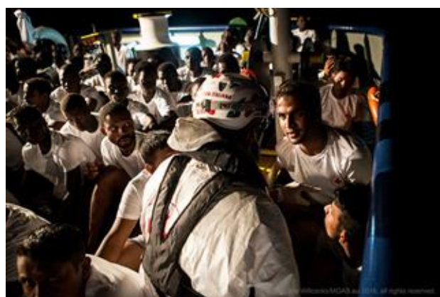
The search and rescue activities conducted by MOAS and the Red Cross staff in the Responder vessel.