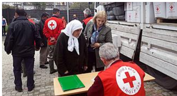
Recent floods in northern Albania affected at least 1,000 families. The Albanian Red Cross distributed flood, clothing and toiletries.

The heavy rainfall has made the water levels of the Drini and Mat rivers rise, which feed five hydroelectricity power lakes built on the rivers (Fierza, Koman, Vau i Dejes, Ulza and Shkopet). Authorities have been obliged to open the emergency gates to release the water from the lakes. The rain is nevertheless falling and the flooding is spreading to the Southern region ( Vlora and Fier areas) with the water level of the Vjosa River rising. In these areas, 25 houses have been affected and the families have been evacuated from their homes.