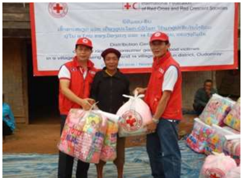
LRC DM and Health Directors at a distribution point in Baeng district.

According to information consolidated by the Lao RC, at least 19,306 people (10,438 males and 8,868 females) have been affected, with five casualties reported thus far. The largest number of affected population is in Oudomxay province. In addition, a joint assessment was convened by the Ministry of Labour and Social Welfare with other ministries and was conducted in the province of Oudomxay.