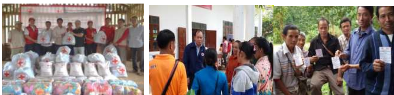
Distribution of food and non-food items in Baeng and Houn districts.

A post distribution survey was conducted right after the distribution to obtain beneficiary feedback on items they have received. The survey findings are being analyzed and will be included in the final report together with SADD.