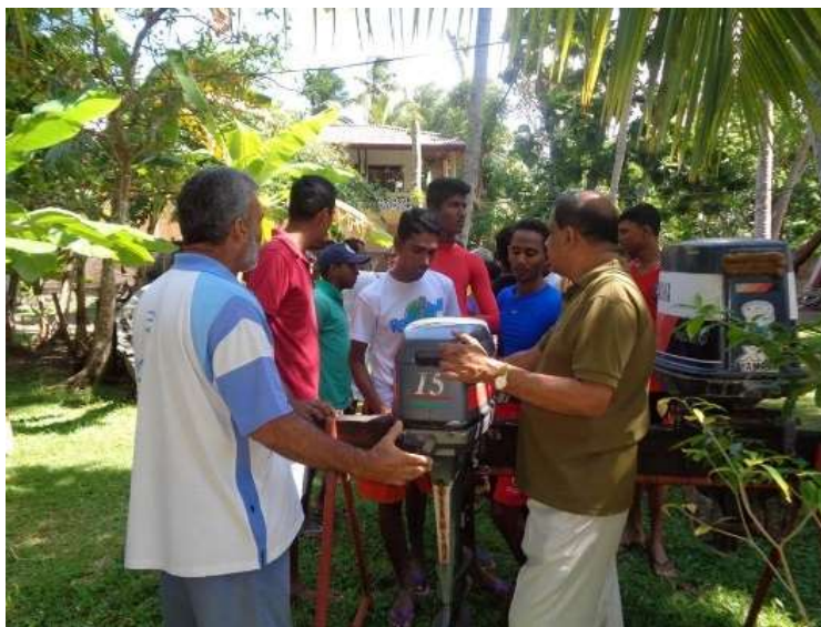
Boat Riding training in Galle.

All procurement of pre-positioned stocks, the boats and nautical accessories has been finalized. The majority of specialized trainings have been conducted. SLRCS completed several training sessions – Assessment training in Colombo and Gampaha, Camp Management training in Kegalle and Boat Riding training in Galle.