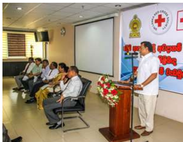
Assessment Training in Colombo.

Sri Lanka was hit by a severe Tropical Cyclone Roanu, that affected 22 districts out of 25 districts in the country, destroying homes and submerging entire villages, triggering floods and a series of landslides that affected thousands of lives and livelihoods, and caused widespread property damage. Initial reports indicated 22 out of Sri Lanka's 25 districts were reported to be affected, among them Colombo, Gampaha, Kegalle, Kurunegala and Puttalam and Ratnapura. At least 104 people are reported dead, 99 people are still missing – many as the result of a landslide in Aranayake, Kegalle District which devastated three villages – and more than 428,000 people affected. Some 4,000 houses were damaged and 600 more were totally destroyed. Thousands of people moved temporarily to camps to seek shelter. In Kegalle district, the Cabinet approved to construct 1,682 new houses.